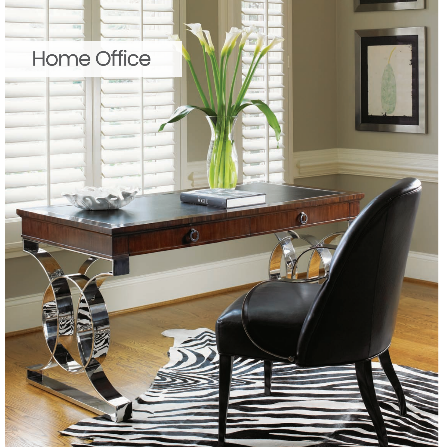
100RW-403 Rosewood Writing Desk 58W x 28D x 30H in.

The Rosewood writing desk features a striking pair of polished stainless steel bases. The black leather top is framed with a stainless steel inlay and Quartered Rosewood around the perimeter.