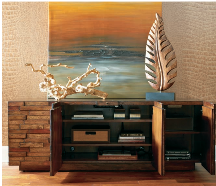
100NL-661 Criss Cross Media Console 72W x 20D x 26H in.

The Criss Cross console is a study in color, character and dimension. Offset blocks of Mahogany, Ash and Birch create an intriguing pattern that looks like contemporary art. There are two adjustable shelves behind the center doors, one adjustable shelf behind each of the outer doors and a five outlet surge protector. This console comes standard with the infrared SmartEye® system and will accommodate the optional Sligh SmartFan®.