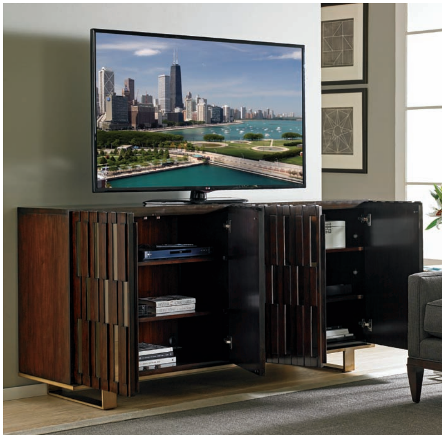
100WN-669 Quantum Media Console 75W x 20D x 36.25H in.

The Quantum media console offers a striking mid-century modern design crafted in Mahogany, with vertical bronze mirror accents on the doors and a brass finished metal base. There are two adjustable shelves behind each pair of doors on the front of the piece. The Sligh infrared SmartEye® is included to control components behind the closed doors, as well as a 5-outlet surge protector. This unit will accommodate the optional Sligh SmartFan®.