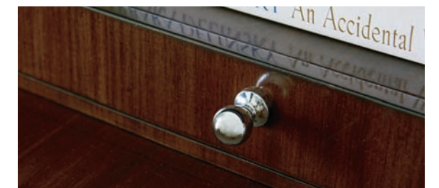
100WW-406 Andrea Writing Desk 62.25W x 28D x 35.5H in.

With a polished stainless base and Quartered Walnut top and gallery, the Andrea writing desk offers a great design statement for the home office. The top shelf above the gallery is half-inch clear glass with a polished edge. There are three drawers in the desk top, and the gallery features three drawers and three open compartments.