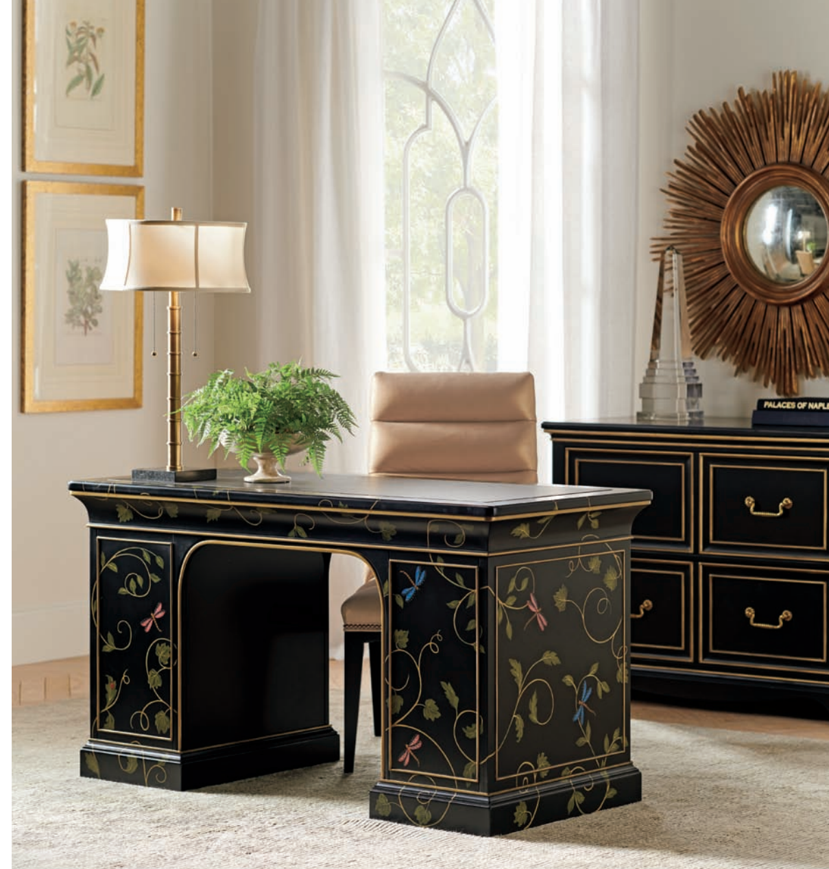
100HP-411 Enchantment Hand-Painted Double Pedestal Desk 54W x 26D x 30H in.

A study in the art of hand-painted design, the Enchantment desk features a floral and dragonfly motif over a rich matte black finish. The perimeter of each panel is trimmed in gold striping. Each desk is unique due to the intricacy of the hand painting. The top features an inset black leather writing surface. On the left are two full-extension self-closing drawers and one file drawer. In the center is a full-extension self-closing drawer. On the right are four full-extension self-closing drawers.