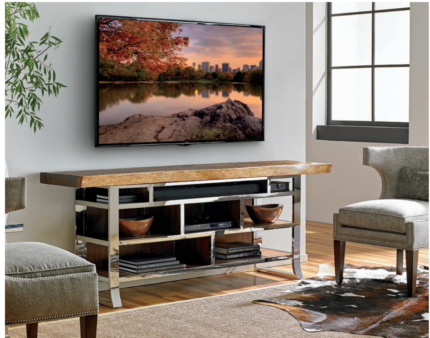
100NL-670 Katara Live Edge Media Console 78W x 18.5D x 30H in.

The Quantum media console offers a striking mid-century modern design crafted in Mahogany, with vertical bronze mirror accents on the doors and a brass finished metal base. There are two adjustable shelves behind each pair of doors on the front of the piece. The Sligh infrared SmartEye® is included to control components behind the closed doors, as well as a 5-outlet surge protector. This unit will accommodate the optional Sligh SmartFan®.