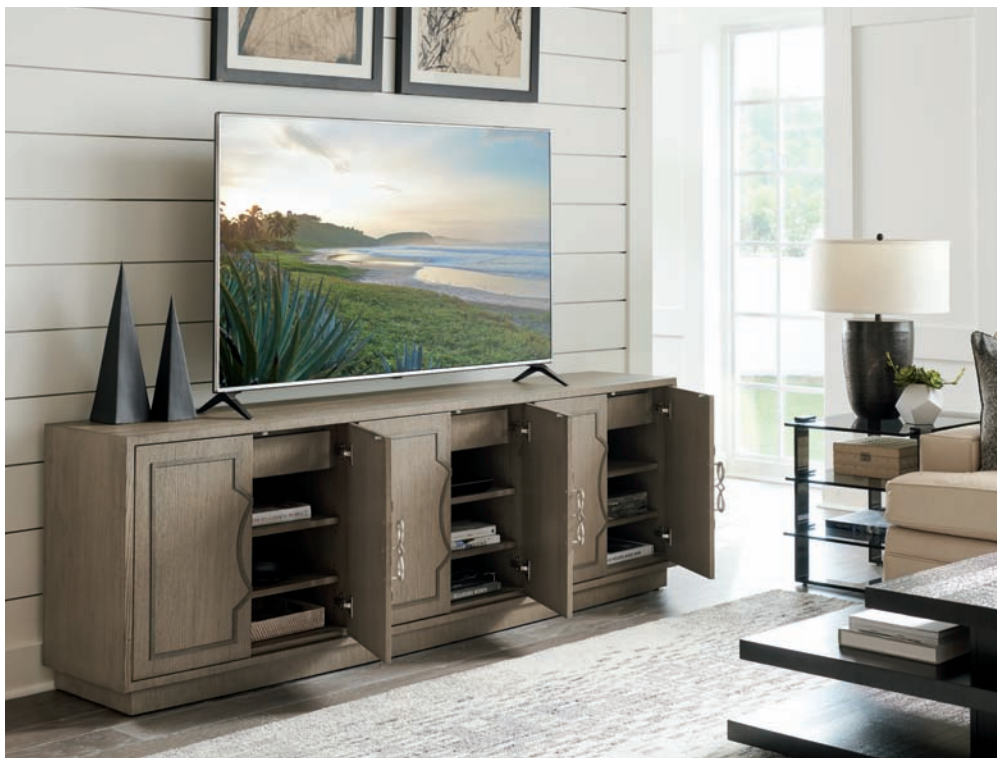
100SD-661 Grove Park Long Media Console 92W x 18D x 30H in.

This 92-inch console makes a grand statement and accommodates the largest of today's monitors. The neo-classical design features an elegant curved front, crafted from quartered ash veneers, in a wire-brushed dove gray finish. The interlocking molding design frames signature door hardware. Behind each pair of doors is a storage drawer and two adjustable shelves.