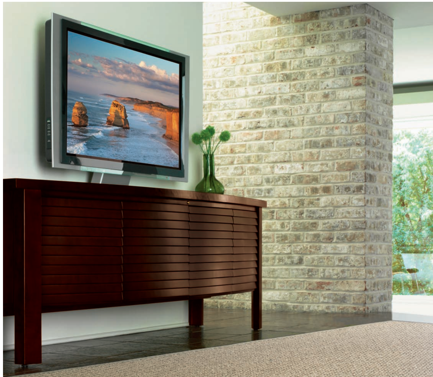
9726-1-UM Lumina Media Console 84.5W x 24D x 28H in.