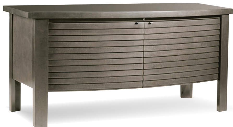
9727-1-AP Lumina Media Console 58W x 24D x 28H in.

The Lumina console has a graceful bow front and louvered design motif. It is offered in your choice of the Umber Cherry or Antique Pewter finish, and is available in both 58-inch and 84-inch lengths. The 58-inch design has two louvered doors and the 84-inch design has four doors. Behind each door is an adjustable shelf and it has a five outlet surge protector. These consoles come standard with the infrared SmartEye® system and will accommodate the optional Sligh SmartFan®.