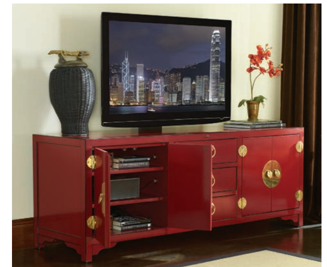
100SR-660 Pacific Isle Media Console 75W x 22.5D x 28H in.