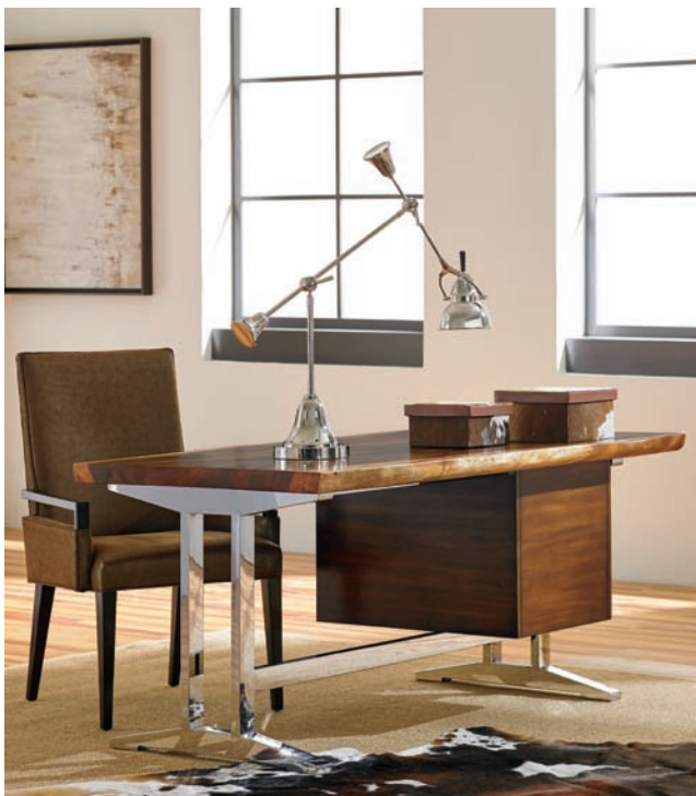
100NL-405 LaCosta Live Edge Writing Desk 68W x 36D x 30H in.

The LaCosta writing desk features a polished stainless base, Mahogany drawer unit and solid Trembesi live-edge top. The Trembesi tree, indigenous to islands in the South Pacific, has the look and characteristics of Black Walnut. Its natural live-edge offers a striking juxtaposition to the contemporary stainless base, giving the piece a unique designer look. The depth and shape of natural tops will vary. The drawer box includes two full extension drawers, with the lower drawer accommodating legal or letter files.