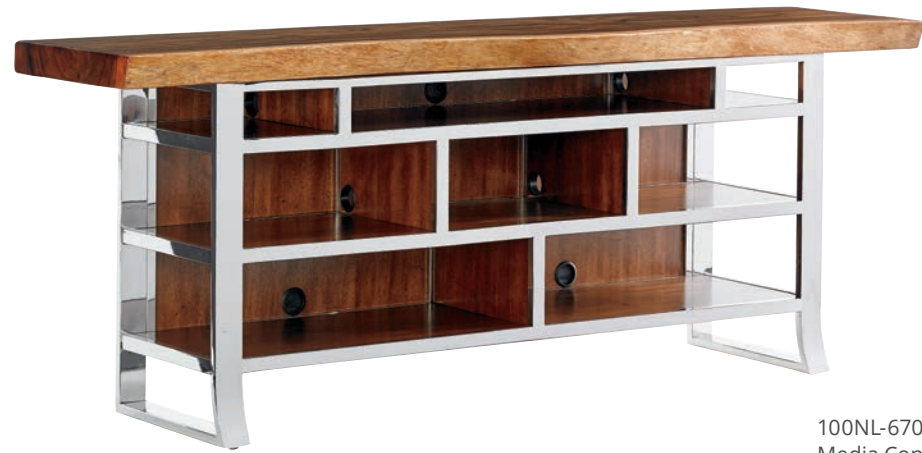
100NL-670 Katara Live Edge Media Console 78W x 18.5D x 30H in.

The Katara media console features a polished stainless base, inset Walnut shelves in eight separate compartments and a solid Trembesi live-edge top. The Trembesi tree, indigenous to islands in the South Pacific, has the look and characteristics of Black Walnut. Its natural live-edge offers a striking juxtaposition to the contemporary stainless base, giving the piece a unique designer look. The depth and shape of natural tops will vary.