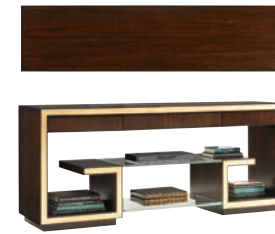
307HW-660 Rodeo Media Console 72W x 18D x 30H in. Gold leaf accents; 3 full extension drawers; 2 ultra clear glass shelves; cord management Shown on page 45