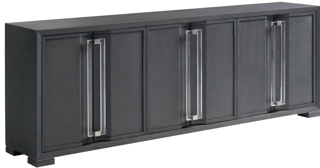
100LN-661 Anthology Long Linen Media Console 97.5W x 18D x 34H in. Linen wrapped case in a gray finish with stainless accents and custom designed acrylic hardware. 6 doors, 9 adjustable shelves, ventilated back

The distinctive design of the Anthology media consoles are clad entirely in linen fabric with a dark slate finish for a sophisticated contemporary look. The custom full-length inset door pulls are crafted from acrylic. The 98-inch version features six doors and six adjustable shelves. The 66-inch design has four doors that open to reveal six adjustable shelves.