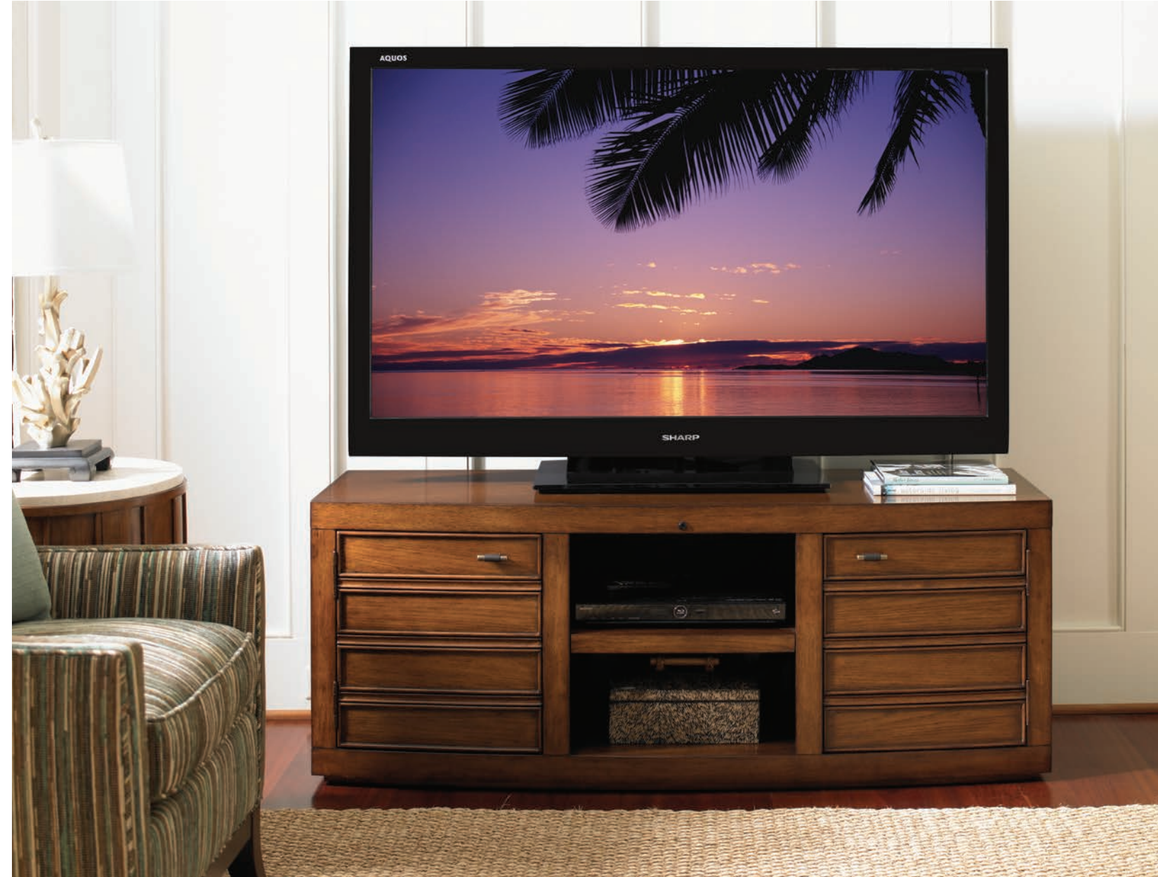
279LK-661 Spinnaker Point Media Console 78W x 22.25D x 23.25H in.

The Longboat Key series takes a casual yet sophisticated approach to contemporary styling. Crafted from Hickory veneers in a warm sundrenched finish, both consoles feature a soft bowfront design. The open compartment in the center has an adjustable shelf, and there are adjustable shelves behind each of the doors. A 5-outlet surge protector is included.