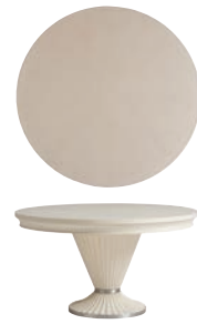
310-300C Artesia Game Table 54 inch diameter x 30H in. Radial matched veneer pattern on top, decorative scalloped cast resin base with brushed nickel finished metal accents. Consists of: 300T Artesia Game Table Top 54 inch diameter x 4H in. 300B Artesia Game Table Base 30.5 inch diameter x 26H in. Shown on page 43