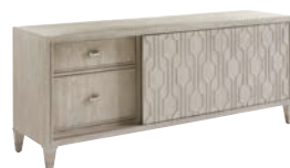
250-661 Reese Media Center 74.5W x 20.5D x 30H in. Decorative wooden fretwork on bypass sliding door fronts, brushed nickel finished metal ferrules. Left side facing: 1 sliding door, 1 full extension storage drawer and 1 full extension file drawer that accommodates legal/letter size files. Cord management. Center: 1 sliding door, 3 adjustable shelves, cord management. Right side facing: 1 sliding door, 1 full extension storage drawer, 2 adjustable shelves, cord management Shown on pages 26, 27 and Back Cover