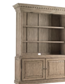
300BA-460 Mt. Bonnell Bookcase 72W x 20.5D x 91.5H in. 300BA-460 Base 66.75W x 18D x 30.75H in. 300BA-460 Deck 72W x 20.5D x 60.75H in. Upper section: 2 wood framed glass shelves; touch lighting; cord management; ventilation Lower section: 2 doors; 2 adjustable shelves; cord management grommets for electrical cords Some assembly required-ships in two cartons Shown on page 35