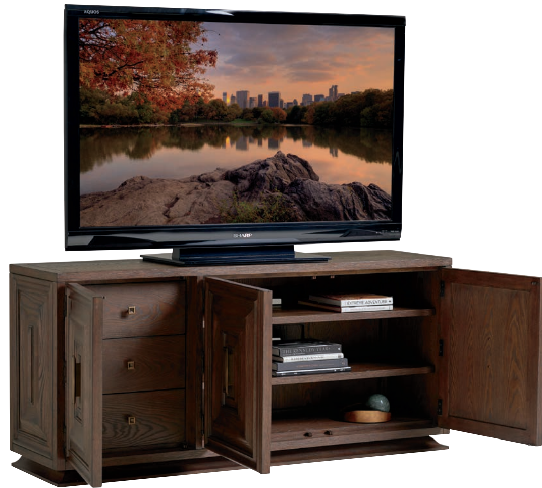
315-660 Easton Media Console 67.5W x 18.5D x 30H in.

Designs in the Barrymore series are crafted from white oak that has been wire-brushed by hand to accentuate the grain patterns, and then finished in a dark walnut coloration. Silhouettes feature traditional overlay moldings and deco-inspired bases. Custom hardware is finished in antique bronze. The 68-inch Easton console features three doors. Behind the left door are three full-extension storage drawers. Behind the pair of doors on the right are two adjustable wooden shelves.