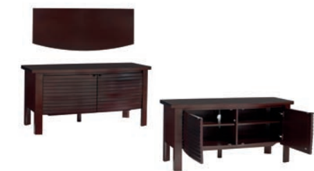
9727-1-UM Lumina Media Console 58W x 24D x 28H in. Umber Cherry finish. Bow front; 2 louvered doors; 2 adjustable shelves, media/component storage; five outlet surge suppressor; cord management; ventilation. Shown on page 9