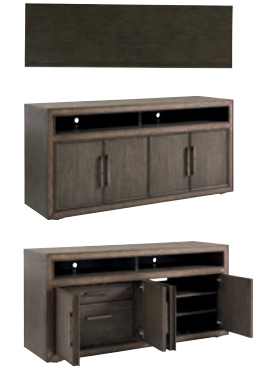
102-660 Hampton Media/Home Office Console 65.5W x 20D x 31H in. Transitional design in a graphite finish crafted from heavily sandblasted quartered oak veneers, with striking custom hardware in a nickel finish with a dark glaze. Textured cast inlay, partitioned open compartment for sound bar storage, and grommet for cord management. Four doors, ventilated back. Behind left side facing doors: One storage drawer and one file drawer that will accommodate legal/letter size files. Behind right side facing doors: Two adjustable shelves. Open compartments between partition 29.75W x 19.25D x 5H in. Sound bar compartment 60.75W x 5.75D x 5H in. Shown on page 22