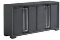
100LN-660 Anthology Linen Media Console 66W x 18D x 34H in. Linen wrapped case in a gray finish with stainless accents and custom designed acrylic hardware. 4 doors, 6 adjustable shelves, ventilated back, grommet, cord management Shown on page 4