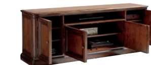
305-661 Waycroft Media Center 78W x 19D x 28.5H in. Left and right side facing: 1 door, 2 adjustable shelves, ventilated back, cord management. Center: Sound bar open compartment, 2 doors, 1 adjustable shelf, ventilated back, cord management. Open area: 41W x 16.75D x 5H in. Shown on pages 36 and 37