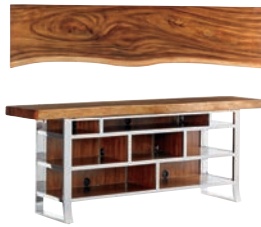
100NL-670 Katara Live Edge Media Console 78W x 18.5D x 30H in. Solid wood Trembesi top in a natural finish on a polished stainless steel base with Walnut shelves and partitions; 8 open compartments; grommets for electrical cords; cord management. 670T Top - 78W x 18.5D x 2.5H in. (Please note that depth will vary due to natural characteristics) 670B Base - 60W x 17.25D x 27.5H in. Shown on pages 16 and 17