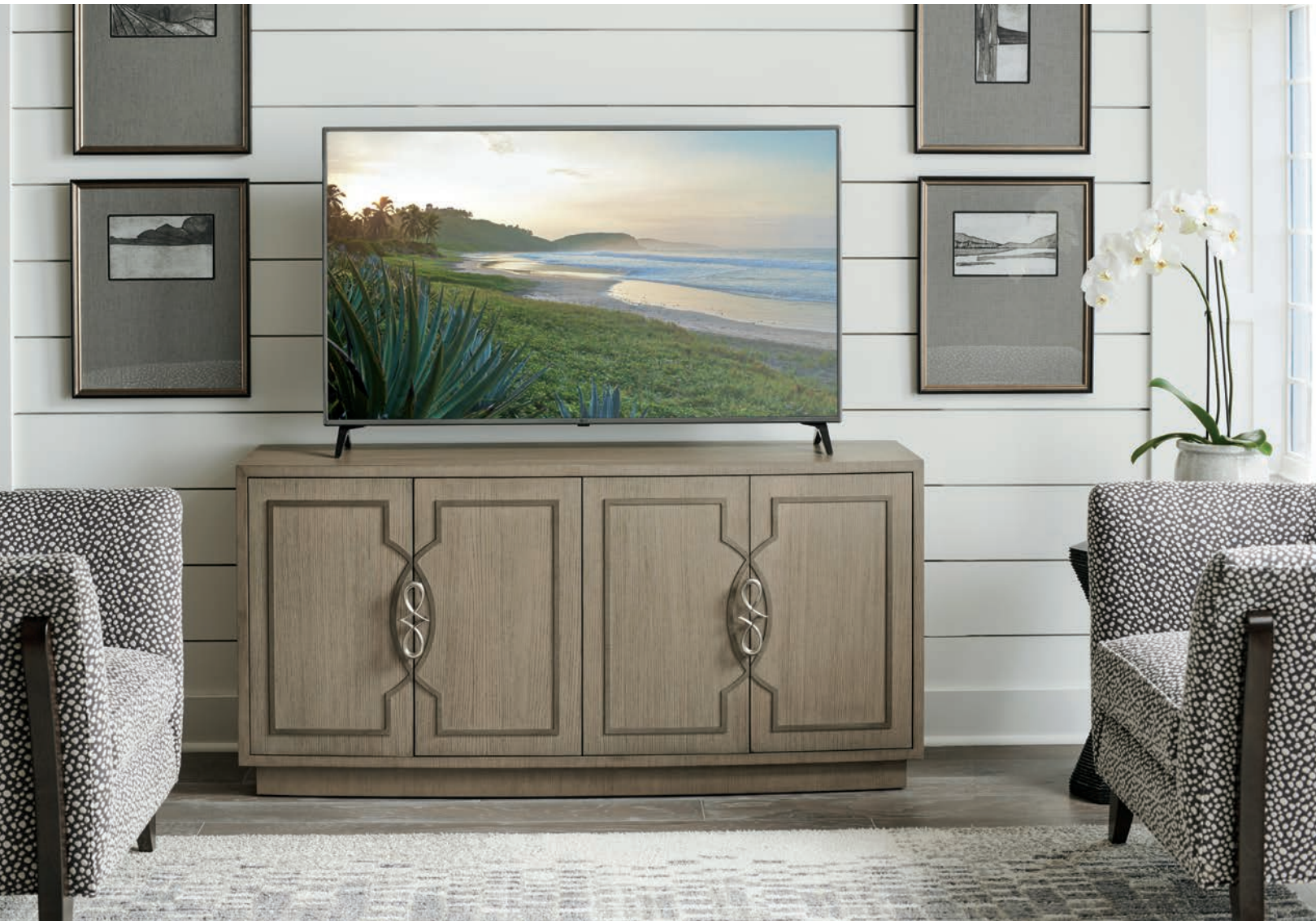
100SD-660 Grove Park Media Console 62W x 18D x 30H in.

This 62-inch console offers generous storage in a mid-size footprint. The neo-classical design features an elegant curved front, crafted from quartered ash veneers, in a wire-brushed dove gray finish. The interlocking molding design frames signature door hardware. Behind each pair of doors is a storage drawer and two adjustable shelves.