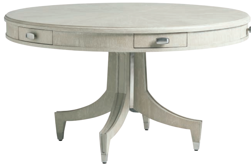
250-300C Roxbury Game Table 54 diameter x 29.5H in.

The Maddox game chairs, available in fabric or leather, feature a graceful curve on the outside back with decorative laser-cut fretwork and brushed nickel ferrules and casters. The standard fabric, 2202-12 Shadow, is an indoor performance fabric in shades of ivory, taupe and gray with an extremely soft hand.