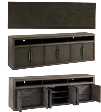
102-661 Hampton Long Media/Home Office Console 95.75W x 20D x 31H in. Transitional design in a graphite finish crafted from heavily sandblasted oak veneers, with striking custom hardware in a nickel finish with a dark glaze. Textured cast inlay, partitioned open compartment for sound bar storage, and grommet for cord management. Six doors, ventilated back. Behind left side facing doors: One storage drawer and one file drawer that will accommodate legal/letter size files. Behind center doors: Two adjustable shelves. Behind right side facing doors: Three full extension drawers. Open compartments between partition 29.75 x 19.25 x 5H in. Sound bar compartment 91.25W x 5.75D x 5H in. Shown on page 23