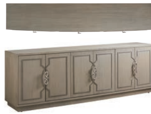
100SD-661 Grove Park Long Media Console 92W x 18D x 30H in. Select hardwoods and quartered ash veneer in a wirebrushed gray finish with custom designed hardware in a brushed nickel finish, 6 doors with decorative overlays, 3 storage drawers, 6 adjustable shelves, ventilated back Shown on Front Cover and page 11