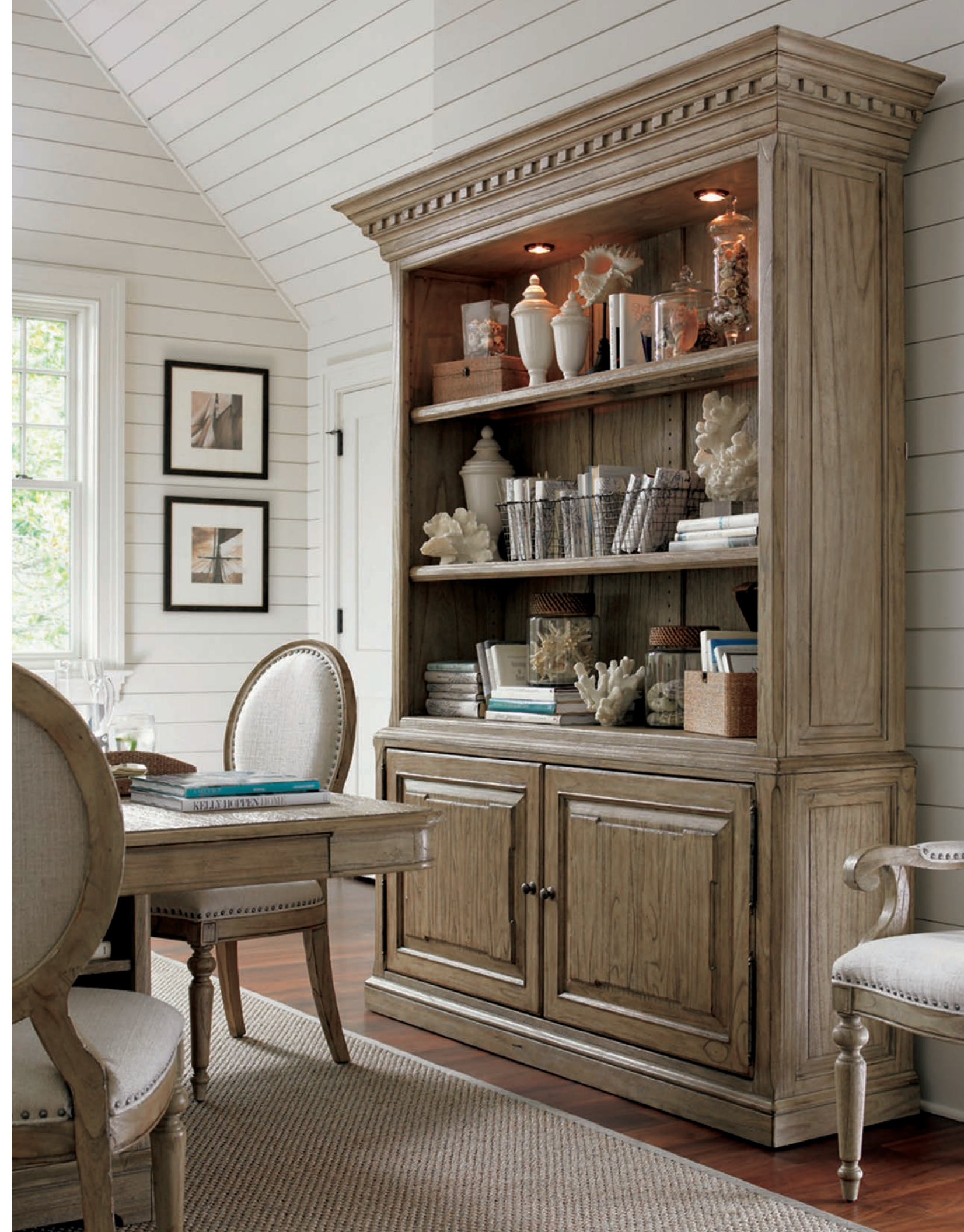
300BA-460 Mt. Bonnell Bookcase 72W x 20.5D x 91.5H in.

The 72-inch Mt. Bonnell bookcase features two wood-framed glass shelves with recessed lighting in the top. Behind the doors in the base are two adjustable shelves. The lower shelf is removable to accommodate a TV monitor.