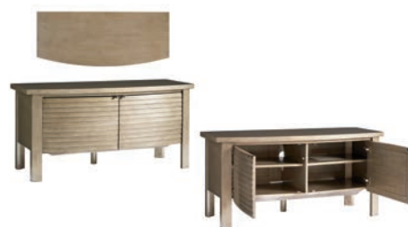
9727-1-AP Lumina Media Console 58W x 24D x 28H in. Antique Pewter finish. Bow front; 2 louvered doors; 2 adjustable shelves, media/component storage; five outlet surge suppressor; cord management; ventilation. Shown on page 8