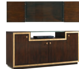
307HW-661 Palisades Media Console 64.5W x 18D x 31H in. Gold leaf accents Left side facing: 1 door; 3 adjustable shelves; ventilation; grommet for electrical cords Center section: 1 ultra clear glass shelf; open compartment; 2 doors; 2 adjustable shelves; ventilation Open compartment dimensions 33W x 17.75D x 5.25H in. Right side facing: 1 door; 3 adjustable shelves; ventilation; grommet for electrical cords Shown on page 44