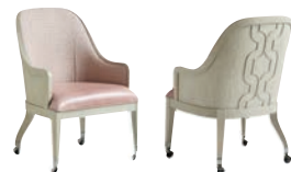
250-938 Maddox Game Chair 25.25W x 25.75D x 37.5H in. Arm 24.5H in. Seat 21.5W x 19.5D x 18.75H in. Decorative laser cut wood overlay on outside back, brushed nickel finished casters. Available in standard fabric 220212 Shadow: An indoor performance fabric, with a woven construction, in soft shades of ivory, gray and taupe. Content: 100% Polyester Shown on pages 28 and 29