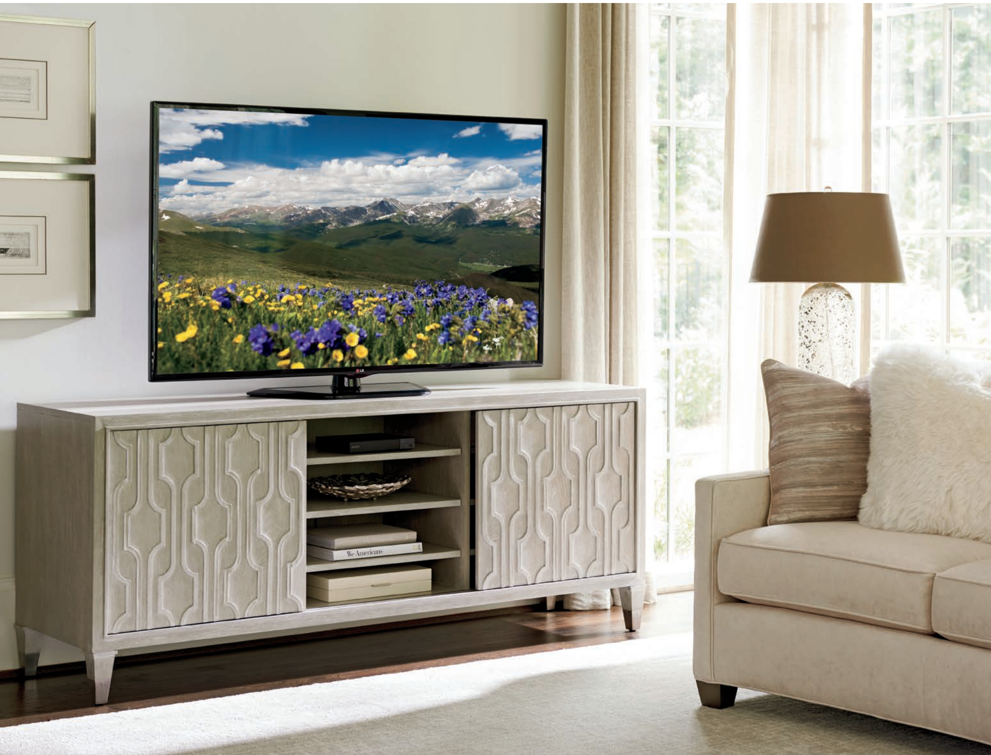
250-661 Reese Media Center 74.5W x 20.5D x 30H in.