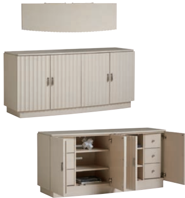
310-660 Ellerston Media Console 64.5W x 20D x 30H in. 4 doors with scalloped fronts, 6 full-extension drawers, 6 adjustable shelves, ventilated back, grommets for electrical cords, plinth base. Shown on page 40