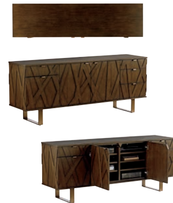
190-661 Ellison Media Center 73.5W x 19D x 30H in. Decorative wooden fretwork on door and drawer fronts as well as end panels. Left side facing: 1 full extension storage drawer and 1 full extension file drawer that accommodates legal/letter size files. Center: 2 doors. Behind the 2 doors are 6 adjustable shelves, ventilated back, and grommets for electrical cords. Right side facing: 3 full extension drawers. Shown on pages 38 and 39