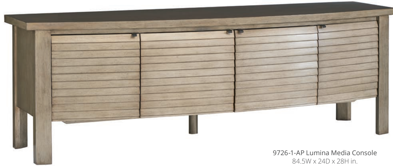
9726-1-AP Lumina Media Console 84.5W x 24D x 28H in.

The Lumina console has a graceful bow front and louvered design motif. It is offered in your choice of the Antique Pewter or Umber Cherry finish and is available in both 58-inch and 84-inch lengths. The 58-inch design has two louvered doors, and the 84-inch design has four louvered doors. Behind each door is an adjustable shelf and each unit includes a five-outlet surge protector.