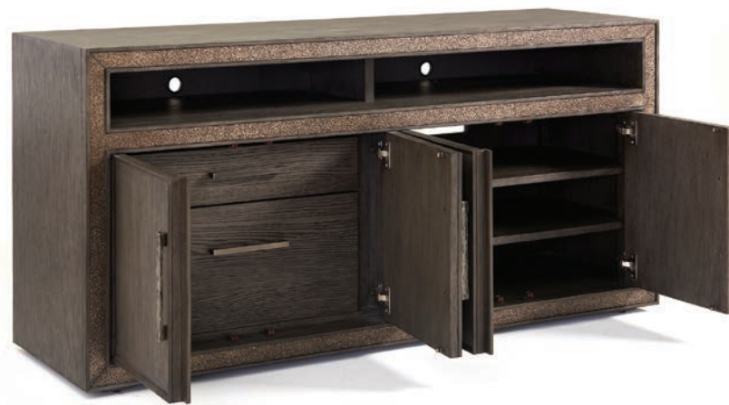
102-660 Hampton Media/ Home Office Console 65.5W x 20D x 31H in. The 66-inch version of the Hamptons office and media console features four doors. Behind the left doors are a storage drawer and a file drawer that will accommodate letter or legal files. Behind the right doors are two adjustable shelves.