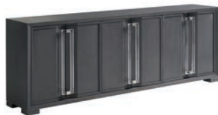
100LN-661 Anthology Long Linen Media Console 97.5W x 18D x 34H in. Linen wrapped case in a gray finish with stainless accents and custom designed acrylic hardware. 6 doors, 9 adjustable shelves, ventilated back, grommets, cord management Shown on pages 4 and 5