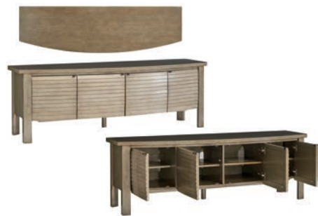
9726-1-AP Lumina Media Console 84.5W x 24D x 28H in. Antique Pewter finish. Bow front; 4 louvered doors; 4 adjustable shelves, media/component storage; five outlet surge suppressor; cord management; ventilation. Shown on page 8