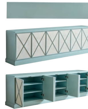
100XM-661 Rosalind Long Media Console 103W x 17.75D x 30.25H in. Transitional design crafted from select hardwoods in a soft pale blue finish. 6 touch latched doors with contrasting faux shagreen fronts and decorative diamond fretwork, 9 adjustable shelves, ventilated backs. Plinth base. Shown on page 15