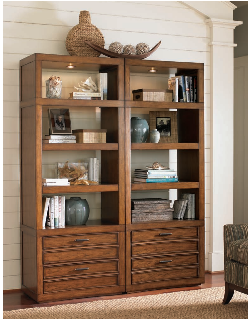
279LK-645 Crystal Sands Bookcase 30W x 18.5D x 77.5H in.

The image on the opposite page shows the 60-inch Plantation Bay TV console and bridge paired with Crystal Sands bookcases on either end. The overall width is 100-inches, offering a striking look with exceptional storage.