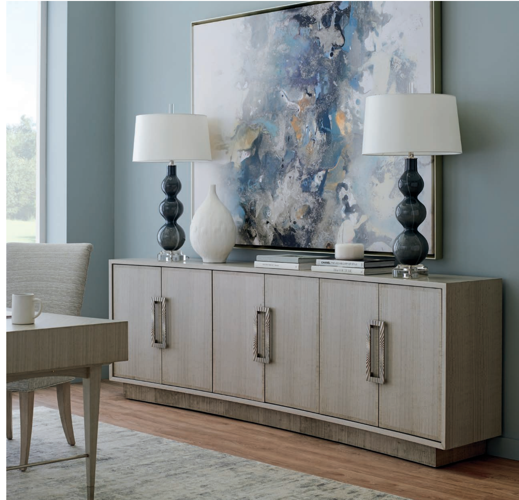
101-661 Donovan Long Media Console 100.5W x 18D x 34H in.

The sweeping concave design of the Donovan media console makes a strong contemporary statement. Crafted from Eucalyptus veneers with contrasting borders in a soft dove gray finish, the design features striking custom door pulls in brushed nickel. The 100-inch unit features six doors with six adjustable shelves and three storage drawers. The left and right facing drawers have removable felt liners and the center drawer is felt lined with partitions.