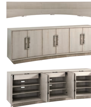
101-661 Donovan Long Media Console 100.5W x 18D x 34H in. Dramatic contemporary design featuring concave shaping, with Eucalyptus veneers in a dove gray finish with contrasting tone borders, and custom brushed nickel hardware. Six doors, three drawers (left side facing drawer has removable felt pad, right side facing drawer is felt lined and divided), six adjustable shelves, ventilated removable back panel, and partition routed for cord management. Shown on page 21