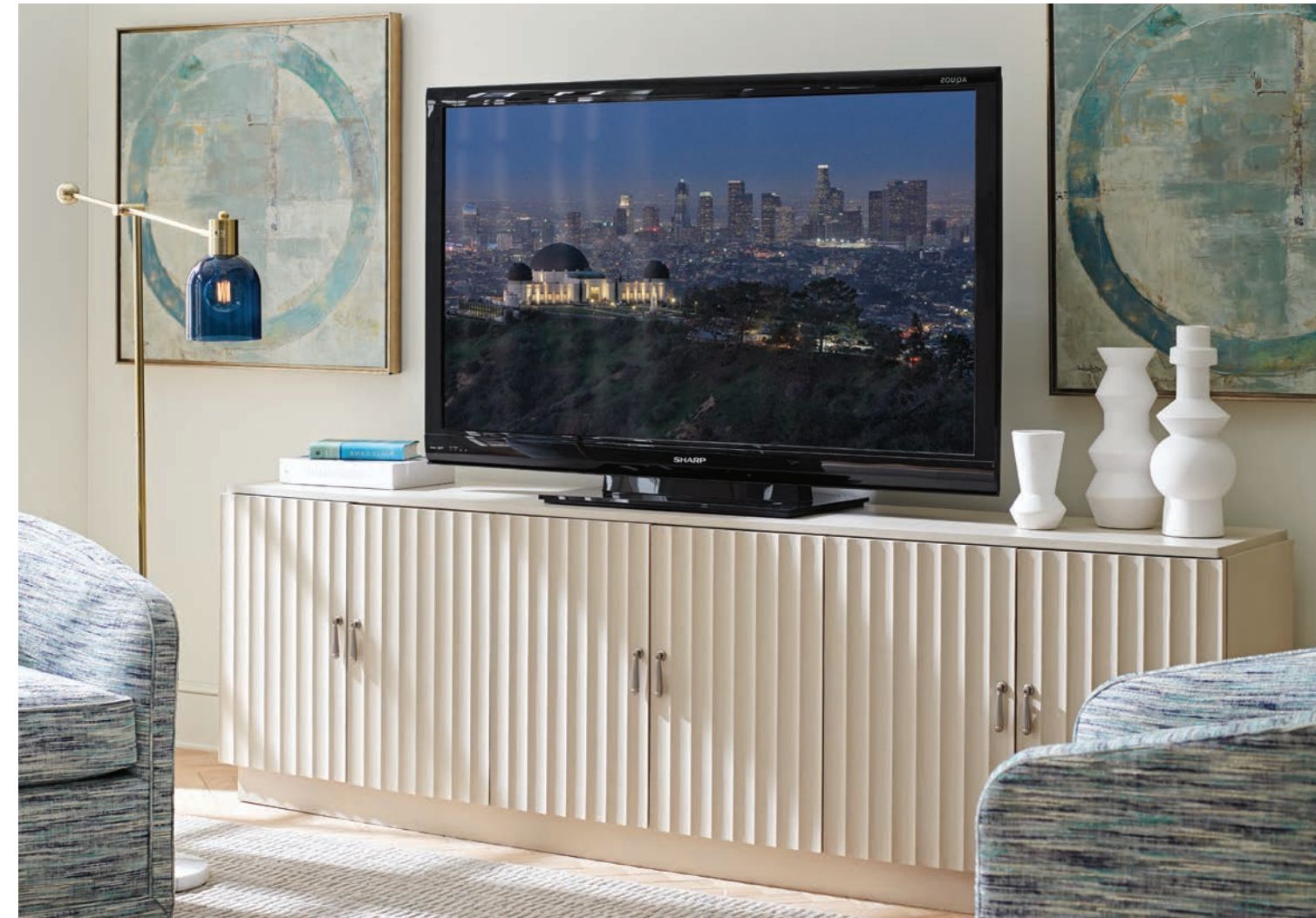
310-661 San Marcos Media Console 96.75W x 20 x 30H in.

The 97-inch San Marcos media console makes a grand statement and accommodates the largest of video screens. The design features a soft bowfront design with 6 doors that showcase the scalloped detail. Behind the center doors are 3 full-extension storage drawers. Behind each pair of outside doors are 2 adjustable shelves.