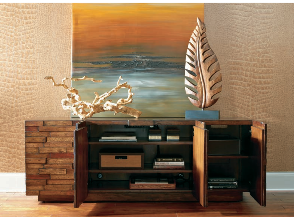
100NL-661 Criss Cross Media Console 72W x 20D x 26H in. The Criss Cross console is a study in color, character and dimension. Offset blocks of Mahogany, Ash and Birch create an intriguing pattern that looks like contemporary art. There are two adjustable shelves behind the center doors, one adjustable shelf behind each of the outer doors and a five outlet surge protector.