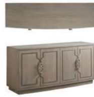
100SD-660 Grove Park Media Console 62W x 18D x 30H in. Select hardwoods and quartered ash veneer in a wirebrushed gray finish with custom designed hardware in a brushed nickel finish, 4 doors with decorative overlays, 2 storage drawers, 4 adjustable shelves, ventilated back. Shown on page 10