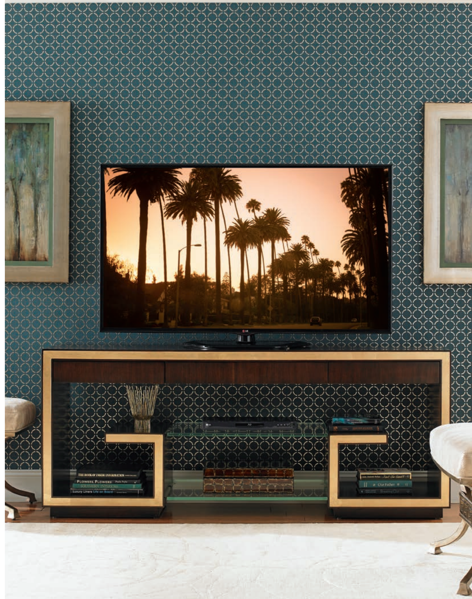
307HW-661 Palisades Media Console 64.5W x 18D x 31H in.