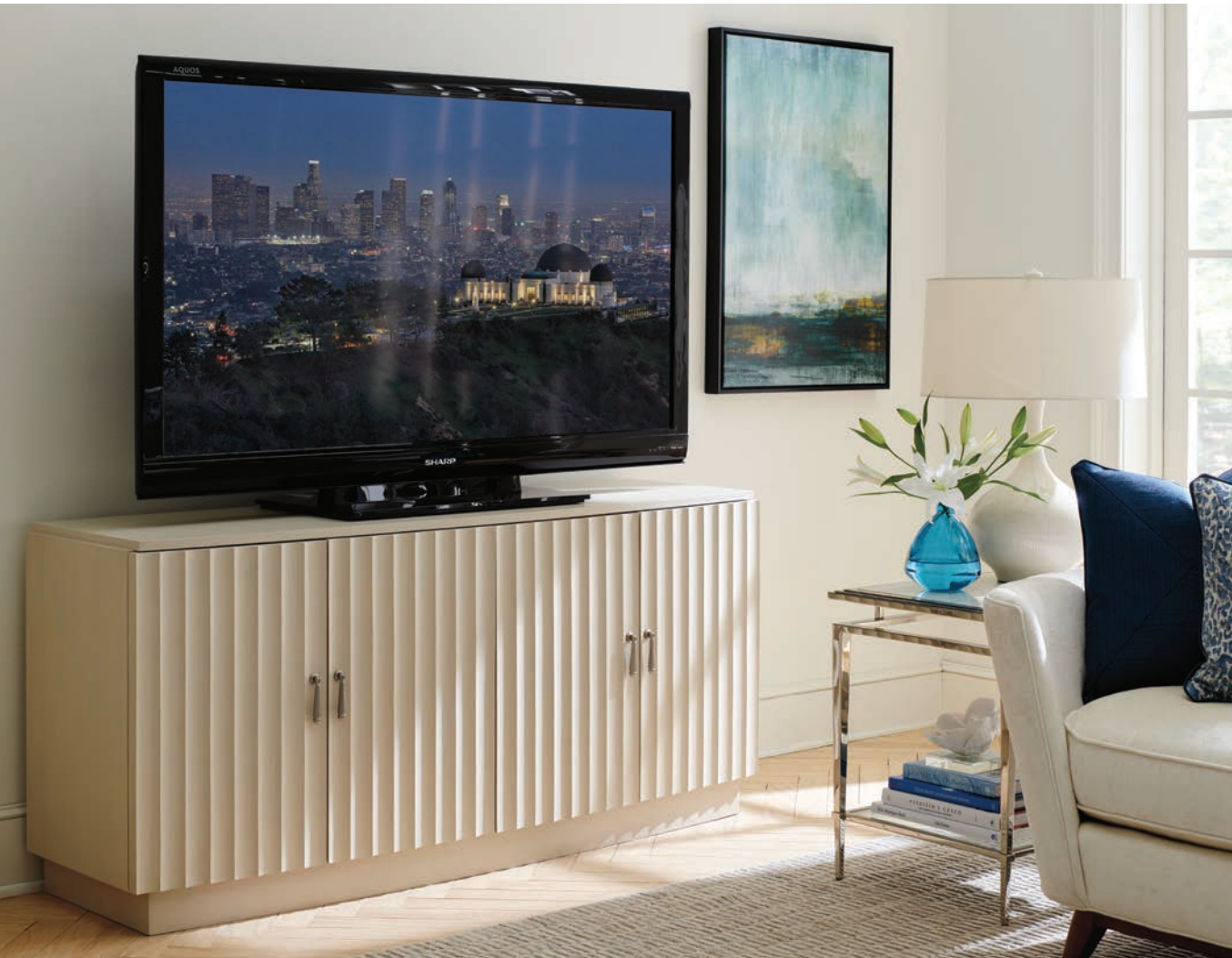
310-660 Ellerston Media Console 64.5W x 20D x 30H in.

The 65-inch Ellerston media console features an elegant bowfront design with 4 doors that showcase the scalloped detail. Behind the doors are 6 full-extension drawers and 6 adjustable shelves.