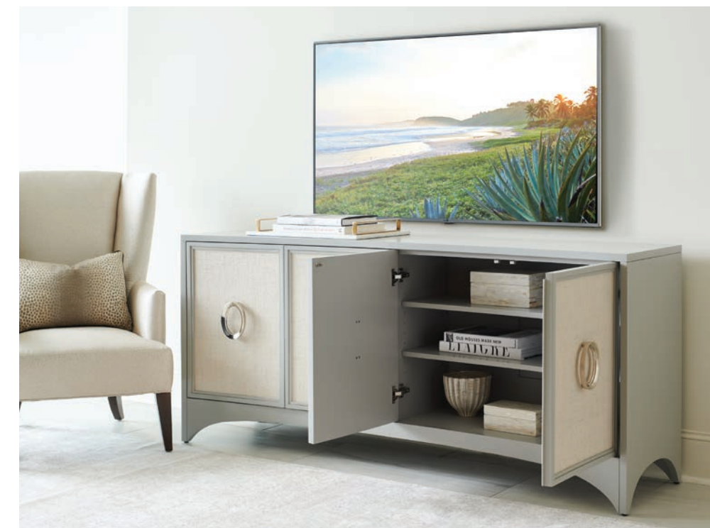
100RF-660 Newbury Park Raffia Media Console 78.25W x 20D x 34H in. The 78-inch Newbury Park media console features a sweeping concave design with graceful arches on the base. It is crafted from maple, painted in a soft dove-gray finish. The doors across the front are clad in raffia in a light ivory finish, with statement hardware in a polished stainless finish. There are four adjustable shelves behind the doors for components and storage.