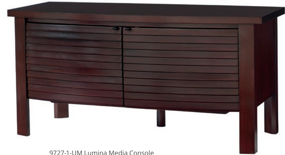
9727-1-UM Lumina Media Console 58W x 24D x 28H in.