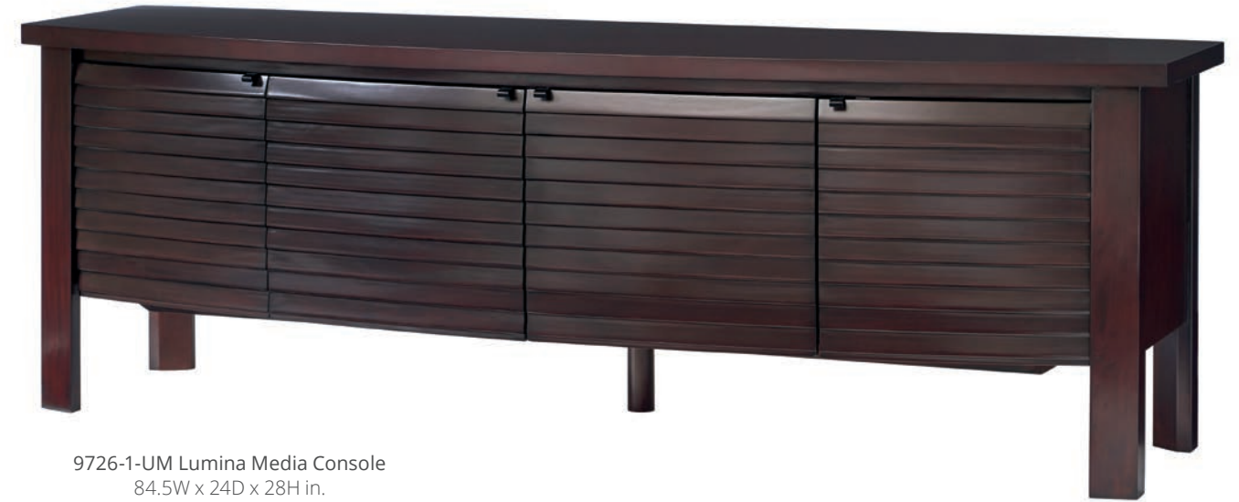
9726-1-UM Lumina Media Console 84.5W x 24D x 28H in.