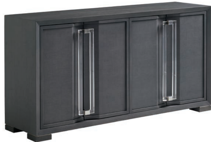
100LN-660 Anthology Linen Media Console 66W x 18D x 34H in. Linen wrapped case in a gray finish with stainless accents and custom designed acrylic hardware. 4 doors, 6 adjustable shelves, ventilated back