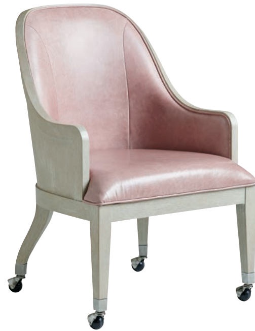
250-938 Maddox Game Chair 25.25W x 25.75D x 37.5H in.