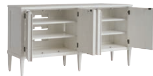
320-660 Clearwater Media Console 67.5W x 18D x 34H in. Caribbean Sands finish, 4 doors, 4 adjustable shelves, ventilated back Shown on page 24