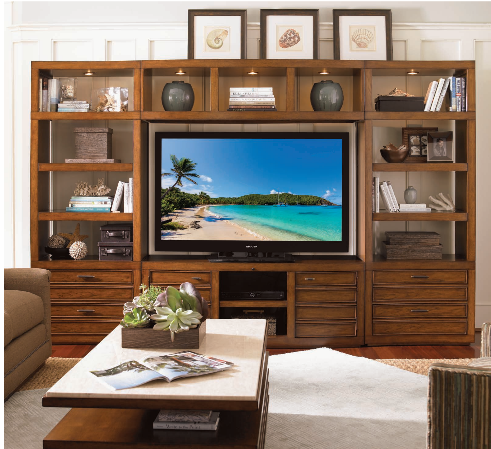
279LK-660 Plantation Bay Media Console 60W x 21.25D x 23.25H in.