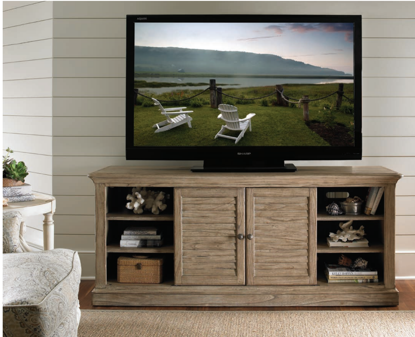
300BA-660 Travis Media Console 64W x 22D x 30.25H in.

Barton Creek offers striking transitional lines in a weathered gray driftwood finish, accented by antique pewter hardware. The Travis console is 64-inches. It features shutter doors that pivot 180 degrees to conceal the center or the end compartments. The center area has a storage drawer at the bottom with two adjustable shelves above. The end compartments each have two adjustable shelves.