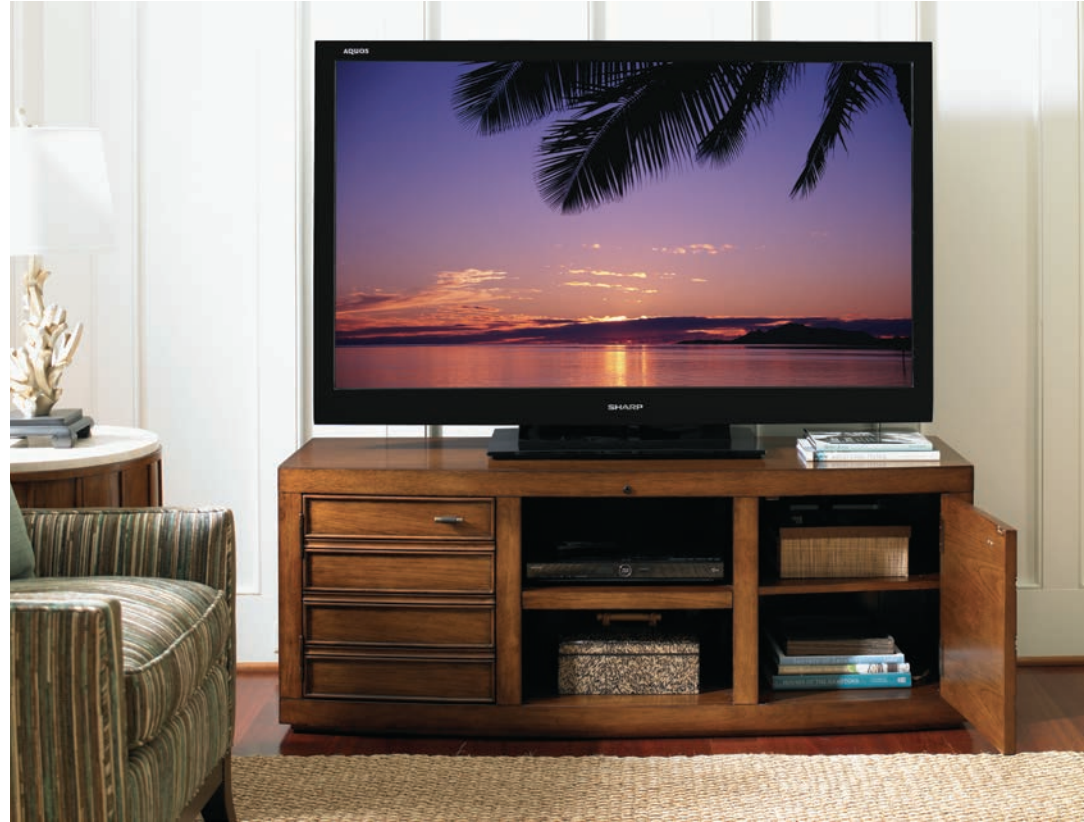
279LK-660 Plantation Bay Media Console 60W x 21.25D x 23.25H in.

The Longboat Key series takes a casual yet sophisticated approach to contemporary styling. Crafted from Hickory veneers in a warm sundrenched finish, both consoles feature a soft bowfront design. The open compartment in the center has an adjustable shelf, and there are adjustable shelves behind each of the doors. A 5-outlet surge protector is included.