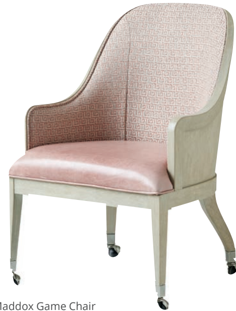
250-938-01 Maddox Game Chair 25.25W x 25.75D x 37.5H in.