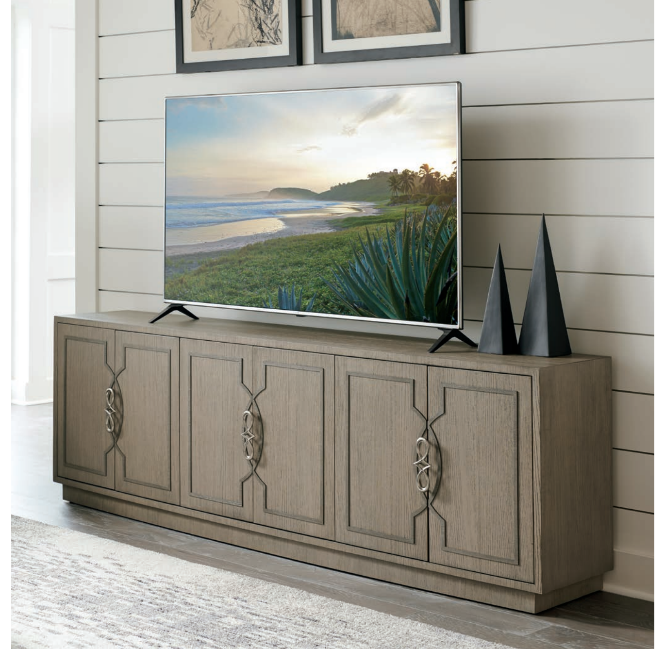
100SD-661 Grove Park Long Media Console 92W x 18D x 30H in.

This 92-inch console makes a grand statement and accommodates the largest of today's monitors. The neo-classical design features an elegant curved front, crafted from quartered ash veneers, in a wire-brushed dove gray finish. The interlocking molding design frames signature door hardware. Behind each pair of doors is a storage drawer and two adjustable shelves.