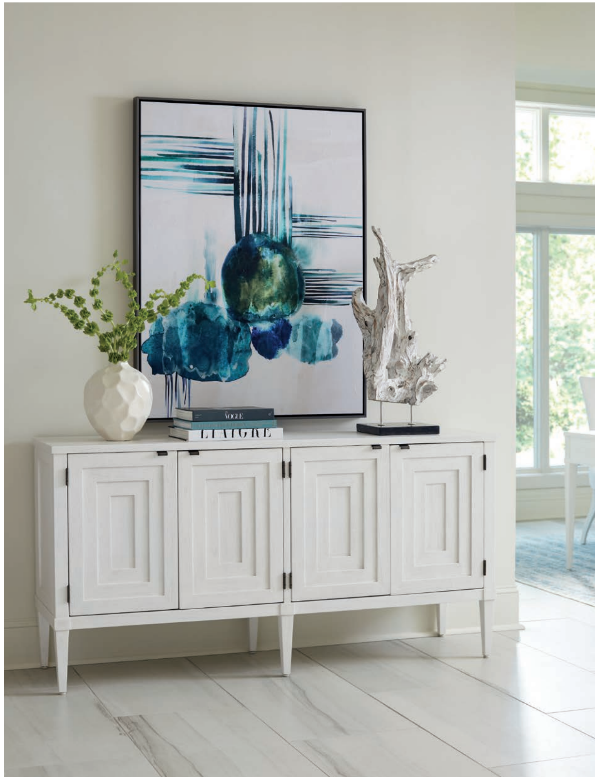
320-660 Clearwater Media Console 67.5W x 18D x 34H in.