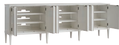
320-661 Clearwater Long Media Console 99.75W x 18D x 34H in. Caribbean Sands finish, 6 doors, 6 adjustable shelves, ventilated back Shown on page 25