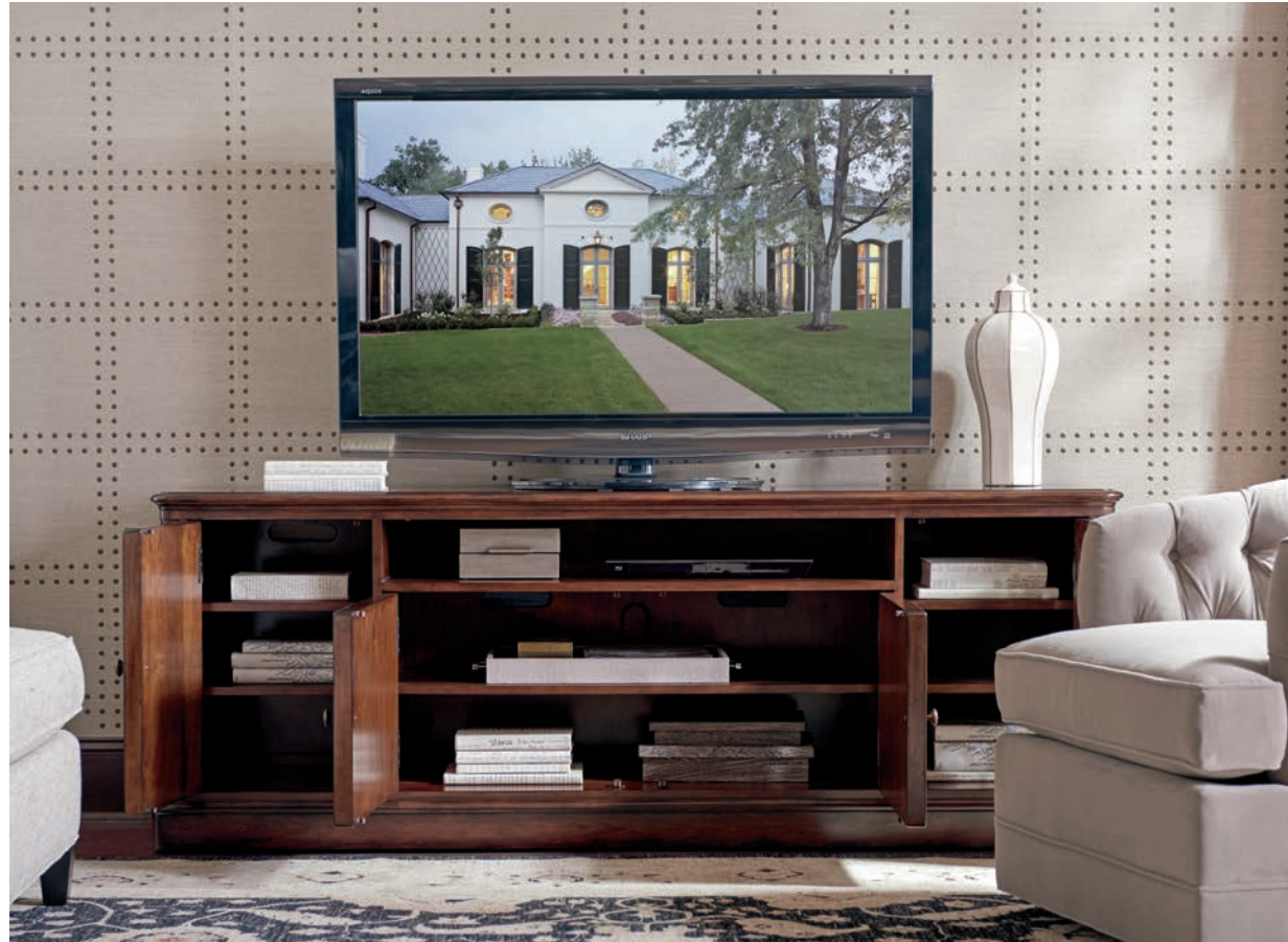
305-661 Waycroft Media Center 78W x 19D x 28.5H in.

The classic lines of the Richmond Hill series are crafted from select cherry veneers. The 78-inch Waycroft media cabinet accommodates electronics and media storage in three compartments behind four doors. Behind each of the outside doors are two adjustable shelves. In the large center compartment is one adjustable shelf. Above that closed compartment is an open area, designed to accommodate a sound bar or media storage. There are grommets for wire management in each compartment.