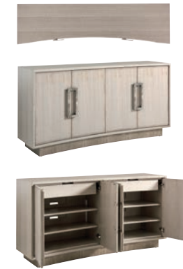
101-660 Donovan Media Console 68W x 18D x 34H in. Dramatic contemporary design featuring concave shaping, with Eucalyptus veneers in a dove gray finish with contrasting tone borders, and custom brushed nickel hardware. Four doors, two drawers (left side facing drawer has removable felt pad, right side facing drawer is felt lined and divided), four adjustable shelves, ventilated removable back panel, and partition routed for cord management. Shown on page 20