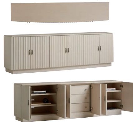
310-661 San Marcos Media Console 96.75W x 20 x 30H in. 6 doors with scalloped fronts, 3 full-extension storage drawers, 4 adjustable shelves, ventilated back, grommets for electrical cords, plinth base. Shown on page 41