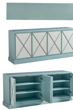
100XM-660 Rosalind Media Console 69.75W x 17.75D x 30.25H in. Transitional design crafted from select hardwoods in a soft pale blue finish. 4 touch latched doors with contrasting faux shagreen fronts and decorative diamond fretwork, 6 adjustable shelves, ventilated backs. Plinth base. Shown on page 14