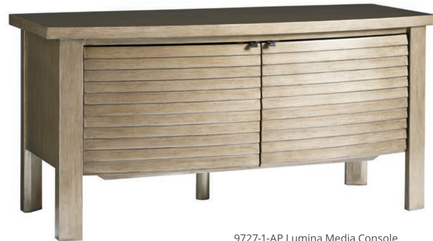
9727-1-AP Lumina Media Console 58W x 24D x 28H in.