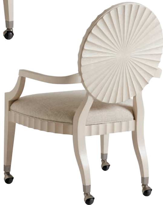
310-938-01 Preston Game Chair with Casters 26.25W x 26D x 40H in.

The Preston game chair with casters offers a great pairing for the Artesia game table. The upholstered inside back and seat are standard in fabric 2221-11 Chatfield, which is a wheat-colored indoor performance fabric featuring a linen weave and a soft hand. The casters are finished in brushed nickel.