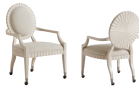
310-938-01 Preston Game Chair with Casters 26.25W x 26D x 40H in. Arm 25H in. Seat 22W x 19.5D x 19.5H in. Brushed nickel finished casters, scalloped outside back and apron. Upholstered inside back and seat available in standard fabric 222111 Chatfield – A wheat colored indoor performance fabric featuring a linen weave construction and soft hand. Contents: 89% Polyester, 11% Linen. Shown on pages 42 and 43

Also available: 310-938 Preston Game Chair with Casters Available in COM, Lexington Upholstery fabrics, a combination of any two fabrics, or Lexington Upholstery leathers.