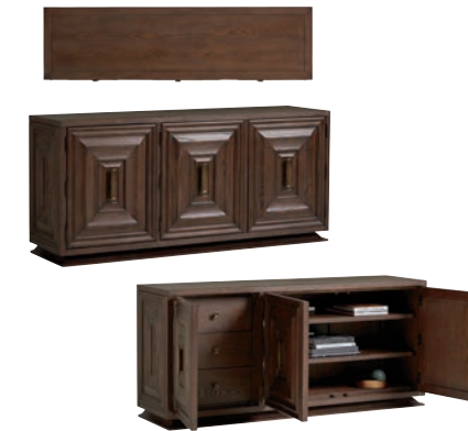
315-660 Easton Media Console 67.5W x 18.5D x 30H in. 3 doors, 3 full-extension drawers, 2 adjustable shelves, ventilated back Shown on pages 48 and 49