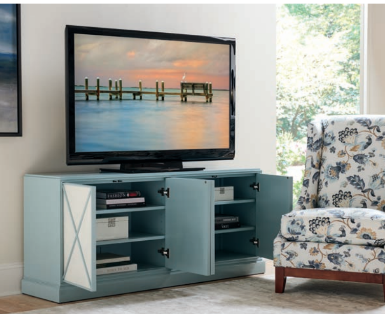
100XM-660 Rosalind Media Console 69.75W x 17.75D x 30.25H in.

The 70-inch Rosalind media console features a soft Tiffany blue painted finish with four contrasting faux shagreen doors, accented by a diamond fretwork design. Behind each pair of touch latch doors are two adjustable shelves.