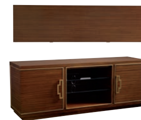
195-660 Aria Media Console 72W x 20D x 26.75H in. Left and right side facing: 1 door, 2 adjustable wooden shelves, ventilated back, grommets for cord management Center: 2 adjustable tempered glass shelves, touch lighting with dimmer switch, ventilated back Shown on pages 46 and 47