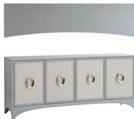
100RF-660 Newbury Park Raffia Media Console 78.25W x 20D x 34H in. Maple veneers and select hardwoods finished in a soft dove gray with custom hardware in a polished stainless finish. Concave top, 4 concave doors with contrasting raffia fronts, 4 adjustable shelves, ventilated back, grommets. Shown on pages 2 and 7