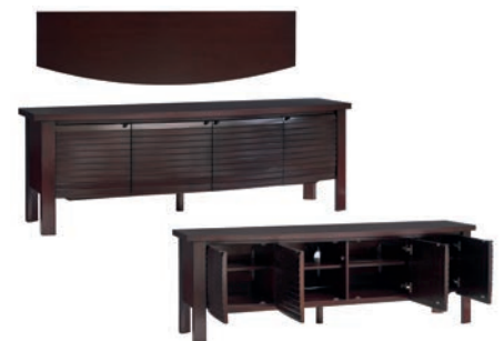
9726-1-UM Lumina Media Console 84.5W x 24D x 28H in. Umber Cherry finish. Bow front; 4 louvered doors; 4 adjustable shelves, media/component storage; five outlet surge suppressor; cord management; ventilation. Shown on page 9