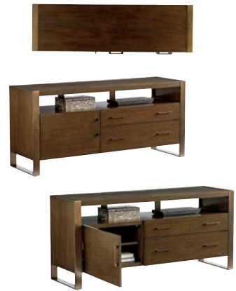
190-660 Paramount Media Console 64W x 19D x 29.25H in. Metal base, open compartment with metal vertical supports, 1 door and 2 full extension drawers. 1 adjustable wooden shelf and ventilated back behind the door. Open compartment 59W x 18.5D x 6H in. Shown on page 38