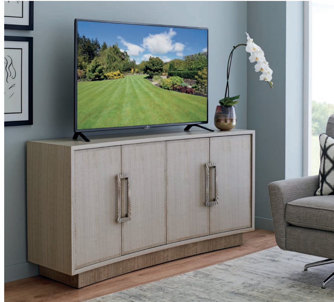
101-660 Donovan Media Console 68W x 18D x 34H in.

The 68-inch version of the Donovan media console has four doors with four adjustable shelves and two storage drawers. The left drawer is felt lined, and the right drawer is felt lined with partitions.