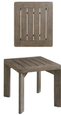
3950-955 La Jolla Rectangular End Table 28W x 24D x 22H in. Shown on pages 2, 4, 5 and 7