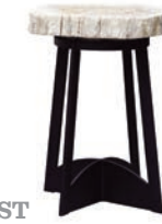
3100-203ST Alfresco Living Petrified Wood Top 15-22 diameter x 2.5H in. Shape Varies from Round to Elliptical