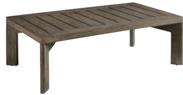
3950-945 La Jolla Rectangular Cocktail Table 52W x 30D x 16.5H in. Shown on pages 2, 4, 5 and 6