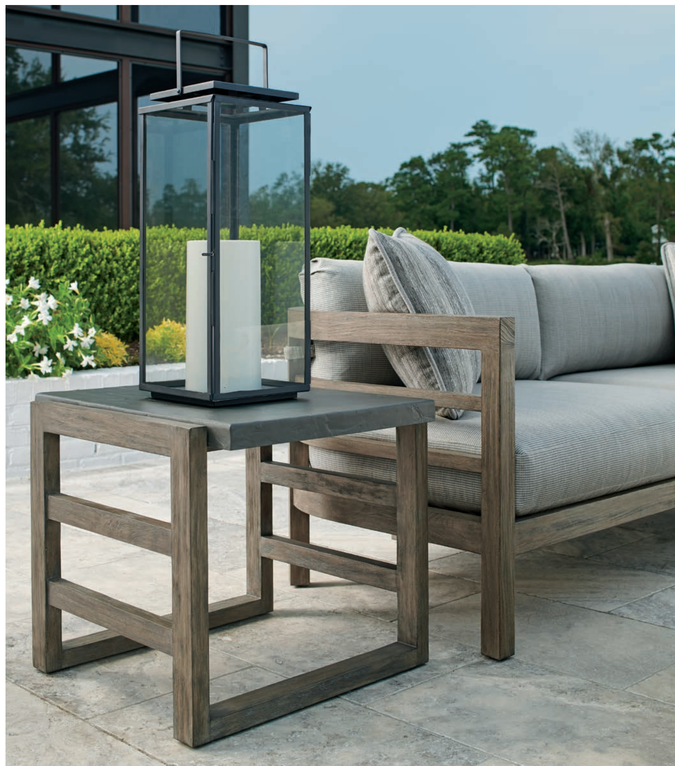
3950-957 La Jolla Cast Top Rectangular End Table 24W x 26D x 22H in.

The cantilevered top on the La Jolla end table features a weather-resistant faux slate top that offers interesting surface texture and complements the sophisticated tones of the Vintage finish. Accent pillows shown are optional.