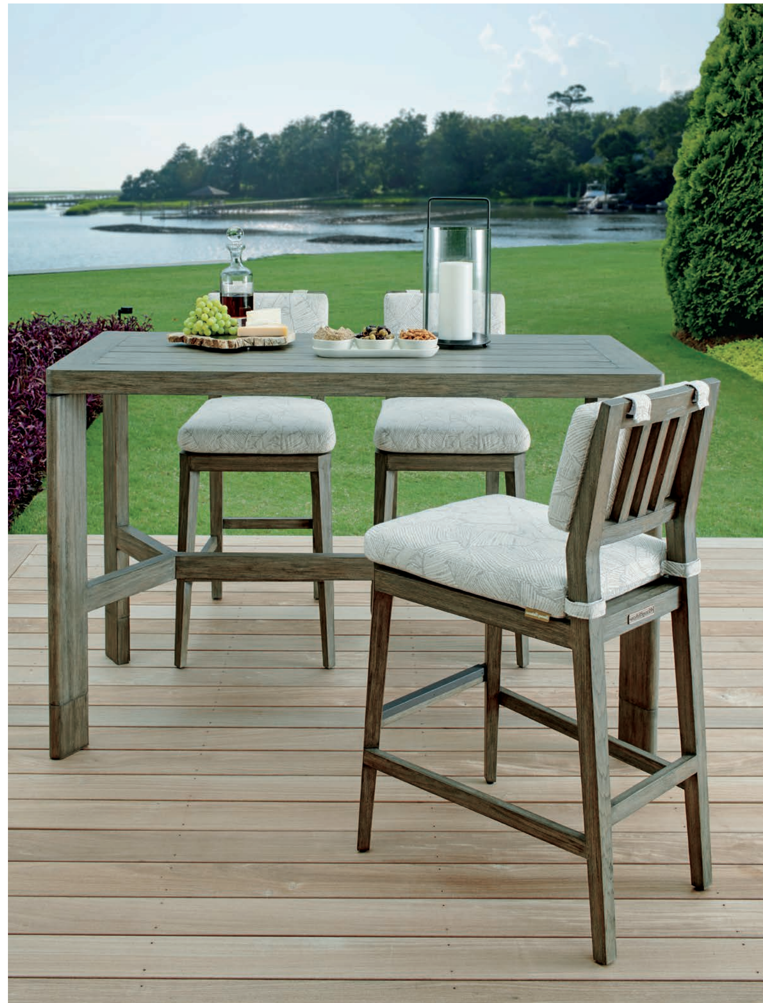
3950-16 / CS3950-16 La Jolla Bar Stool and Cushion Set 20W x 26D x 45.5H in.