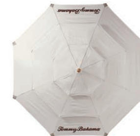
3100-610 Tommy Bahama Signature Umbrella 11 ft. diameter x 8 ft. 9 in. H Pole type and color:

2 inch, one piece wooden pole Fabric number and color: 7404-15, canvas; dark brown logo Umbrella canopy is 11-foot diameter and double wind vented. Canopy has two silk screened Tommy Bahama logos (shown above) and one color ink as noted.