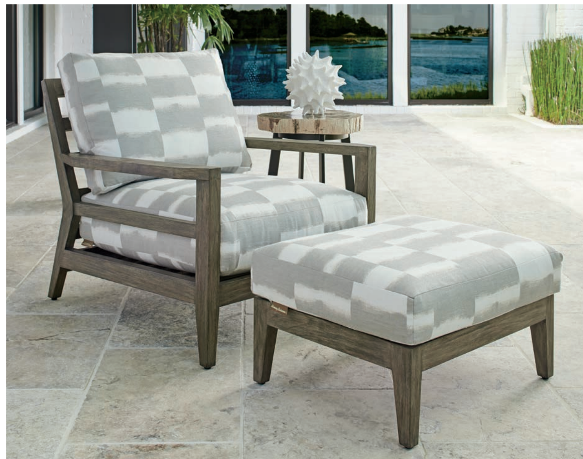
3950-10 / CS3950-10 La Jolla Occasional Chair and Cushion Set 31.5W x 37.25D x 32H in.