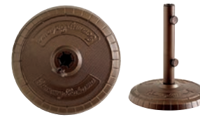
3100-35CUB Tommy Bahama Cast Aluminum Umbrella Base 18 diameter x 21H in.

2 inch, one piece wooden pole Fabric number and color: 7404-15, canvas; dark brown logo Umbrella canopy is 11-foot diameter and double wind vented. Canopy has two silk screened Tommy Bahama logos (shown above) and one color ink as noted.