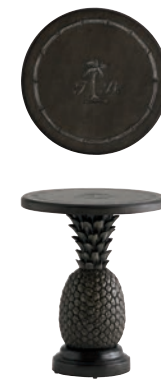
3100-202 Alfresco Living Pineapple Table Base & Top 18.25 diameter x 22H in. Weathered driftwood top on a charcoal gray pedestal