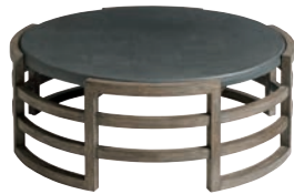
3950-947 La Jolla Round Cocktail Table 47 diameter x 16.5H in. Shown on Cover and pages 9 and 13