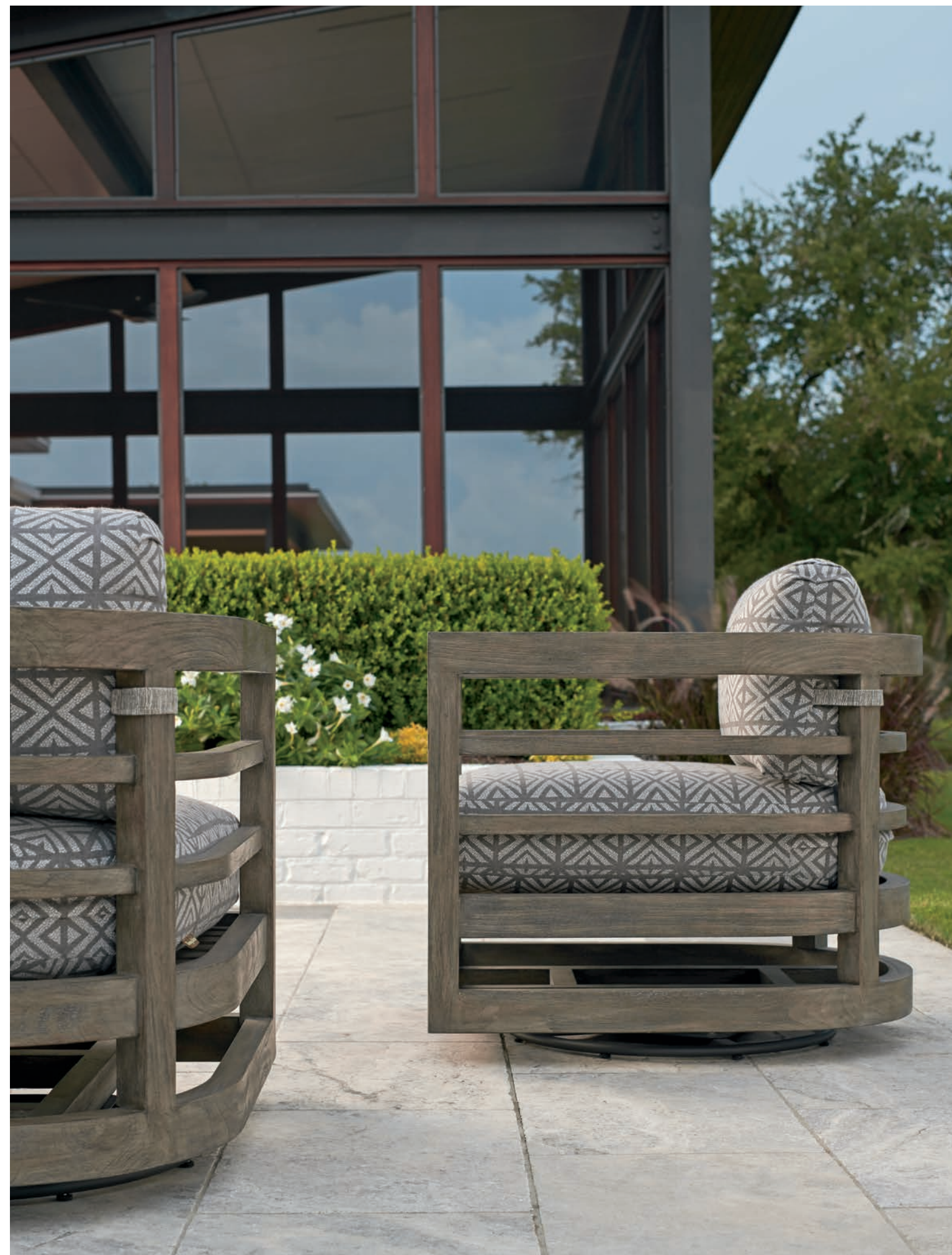
3950-09SW / 3950-09SW La Jolla Occasional Swivel Chair and Cushion Set 28.5W x 35.5D x 33H in.