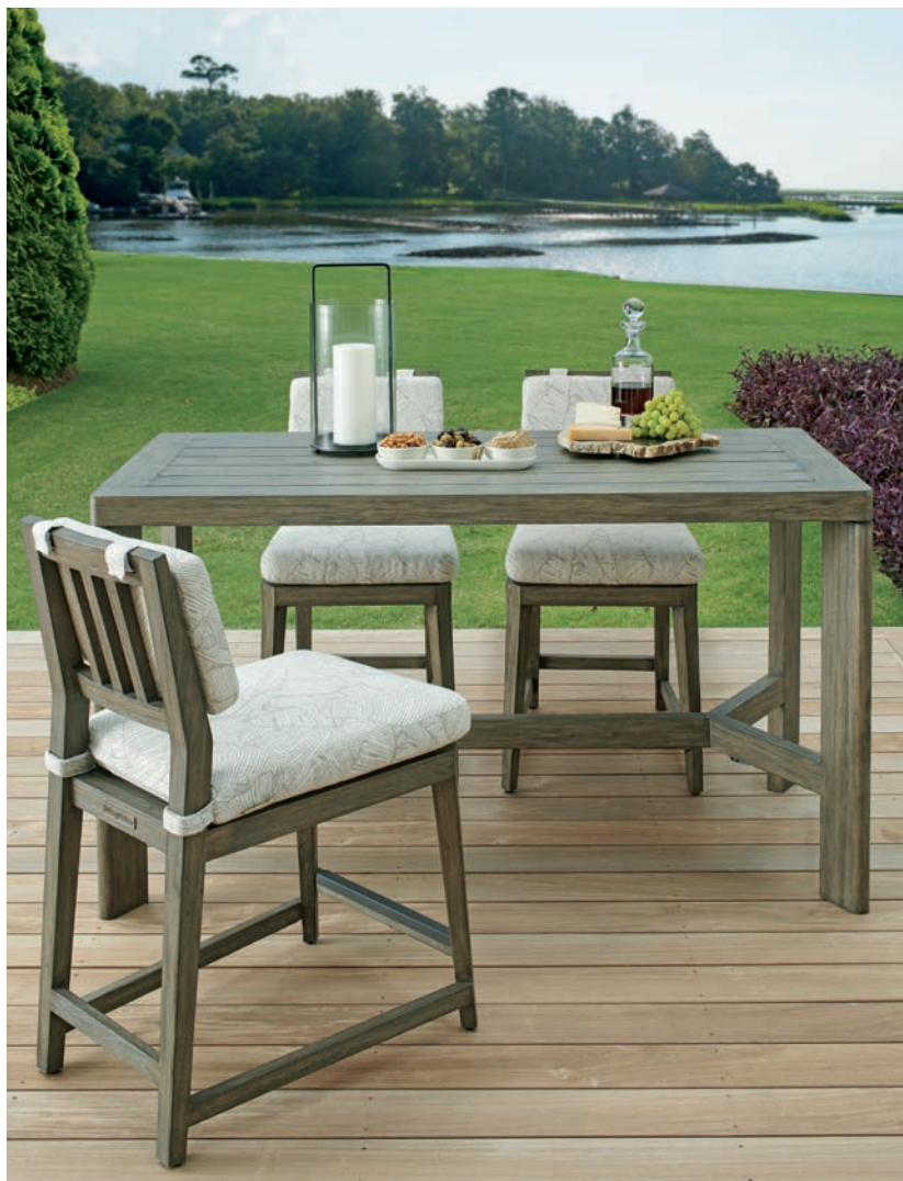
3950-873 La Jolla High/Low Bistro Table (in low position) 64W x 30D x 37.5H in.