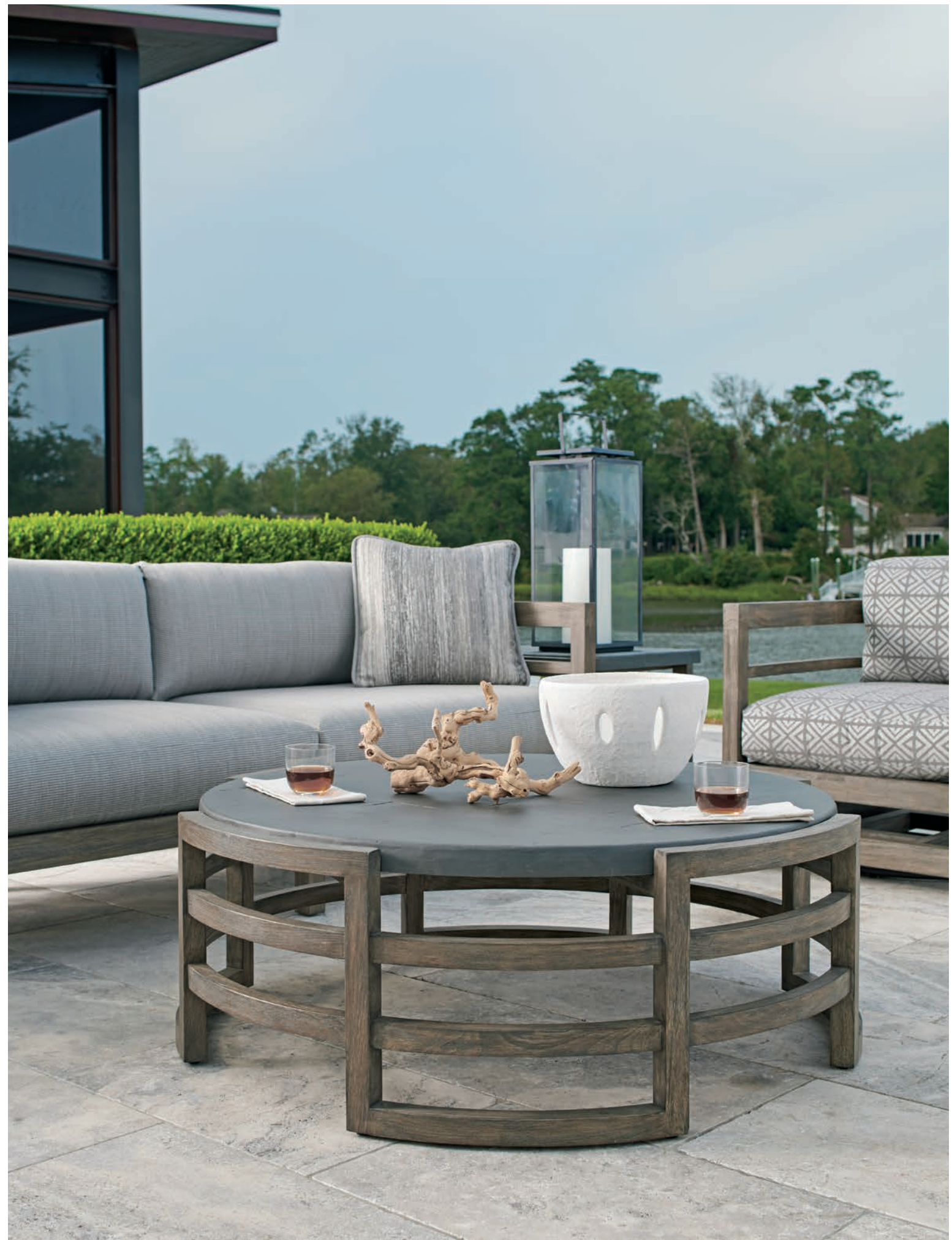
3950-947 La Jolla Round Cocktail Table 47 diameter x 16.5H in.