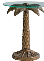
3100-204 Alfresco Living Palm Tree Table Base with Tempered Glass Top 20 diameter x 24H in. Details Enhanced by the Burnished Bronze Finish