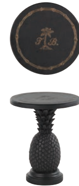
3100-201 Alfresco Living Pineapple Table Base & Top 18.25 diameter x 22H in. Rich Black Coloration with Golden Highlights