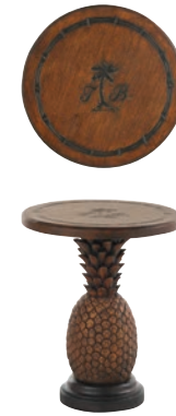
3100-200 Alfresco Living Pineapple Table Base & Top 18.25 diameter x 22H in. Light Sienna Top on Golden Sienna Pedestal