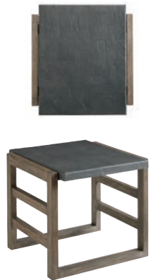
3950-957 La Jolla Cast Top Rectangular End Table 24W x 26D x 22H in. Shown on Cover and pages 6, 8, 9, 10 and 17