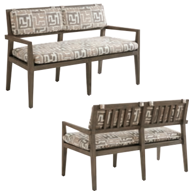
3950-936 La Jolla Bench Frame Only 56.5W x 26.25D x 35.5H in. Arm: 25H in., Seat: 19H in. Inside: 54W x 19.25D in.