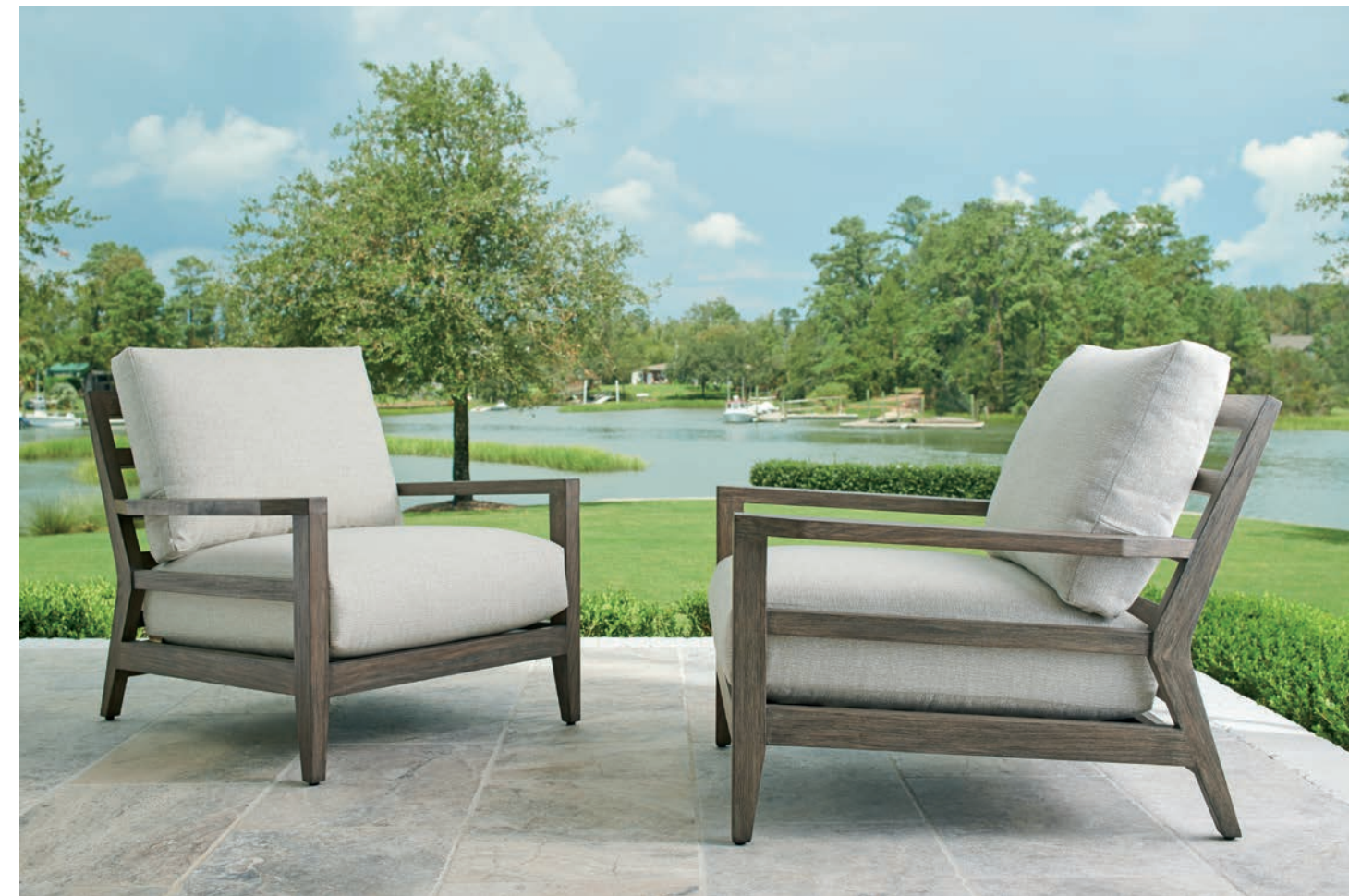
3950-10 / CS3950-10 La Jolla Occasional Chair and Cushion Set 31.5W x 37.25D x 32H in.

The dramatic angle created between the rear legs and the back of the La Jolla occasional chair serves as an invitation to sit and enjoy the comfort of a design with the perfect pitch. The pineapple chairside table is a new finish on a design from the Alfresco Living collection. On the opposite page, the Velcro straps that secure the cushion to the frame of the Chaise Lounge will be tailored in the same fabric as the cushion.