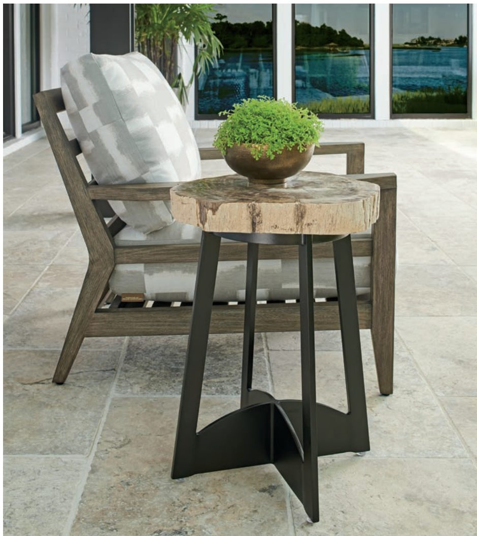
3100-203ST Alfresco Living Petrified Wood Top 15-22 diameter x 2.5H in.