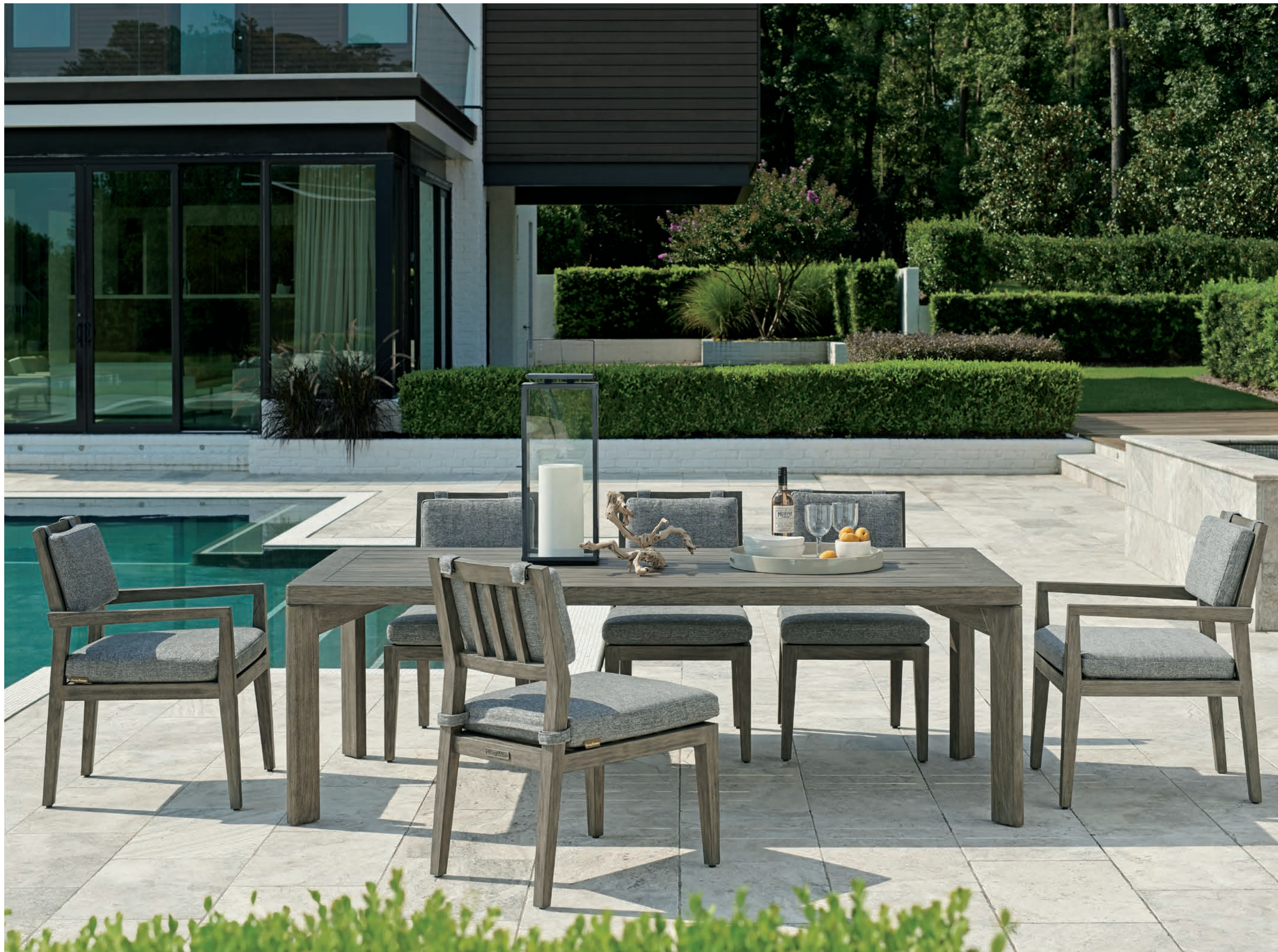
3950-877 La Jolla Rectangular Dining Table 88W x 42D x 29H in.

The 88-inch rectangular dining table comfortably accommodates eight guests. The side and arm chairs are designed with slots in the top of the chair back to accommodate a Velcro strap for the back cushion. The result is an exceptionally comfortable dining experience. The strap will be tailored in the same fabric as the cushion.