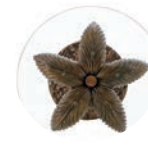
3100-203TB Alfresco Living Metal Table Base 20.5W x 20.5D x 18H in.