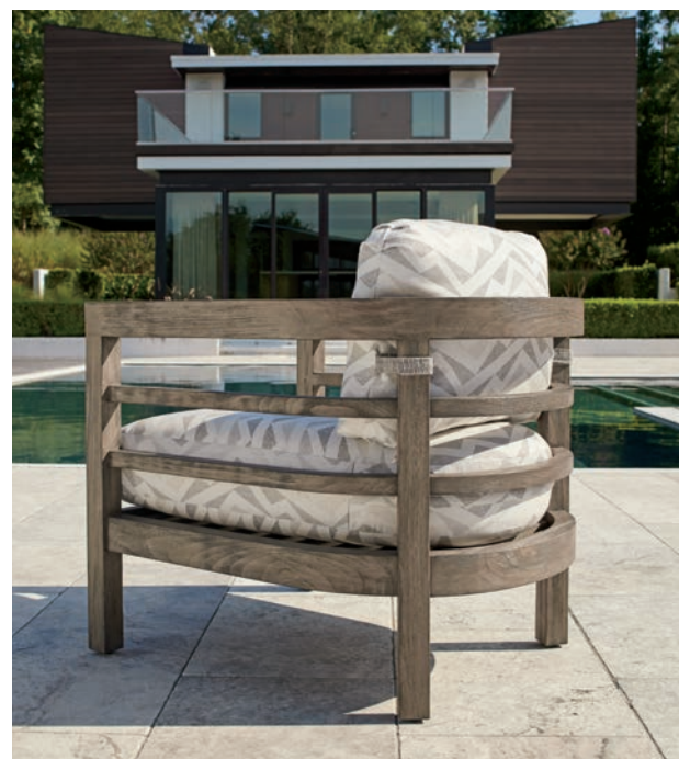
3950-11 / CS3950-11 La Jolla Lounge Chair and Cushion Set 28.5W x 35.5D x 33H in.