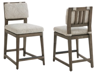
3950-17 La Jolla Counter Stool Frame Only 20W x 26D x 39.5H in. Seat: 24H in. Inside: 20W x 19.5D in.