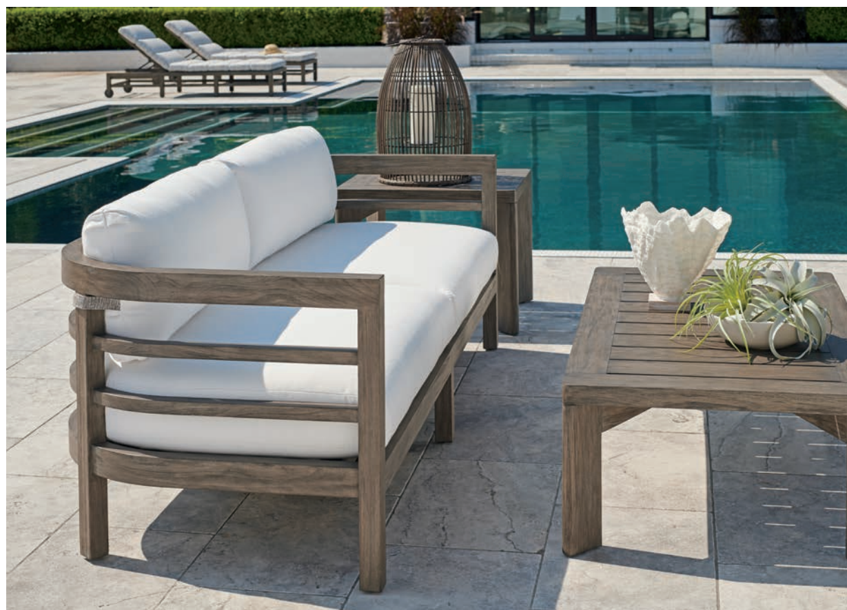
3950-33 / CS3950-33 La Jolla Sofa and Cushion Set 82W x 35.5D x 35.5H in.

The accent pillow shown on the opposite page features a larger ½ inch welt. This is a no-charge option on all throw pillows, but must be specified. Throw pillows come standard with ¼ inch welts on all sides. When the large welt option is specified, the welt will be applied to three sides only, with the zipper closure on the bottom side. Accent pillows shown are optional.