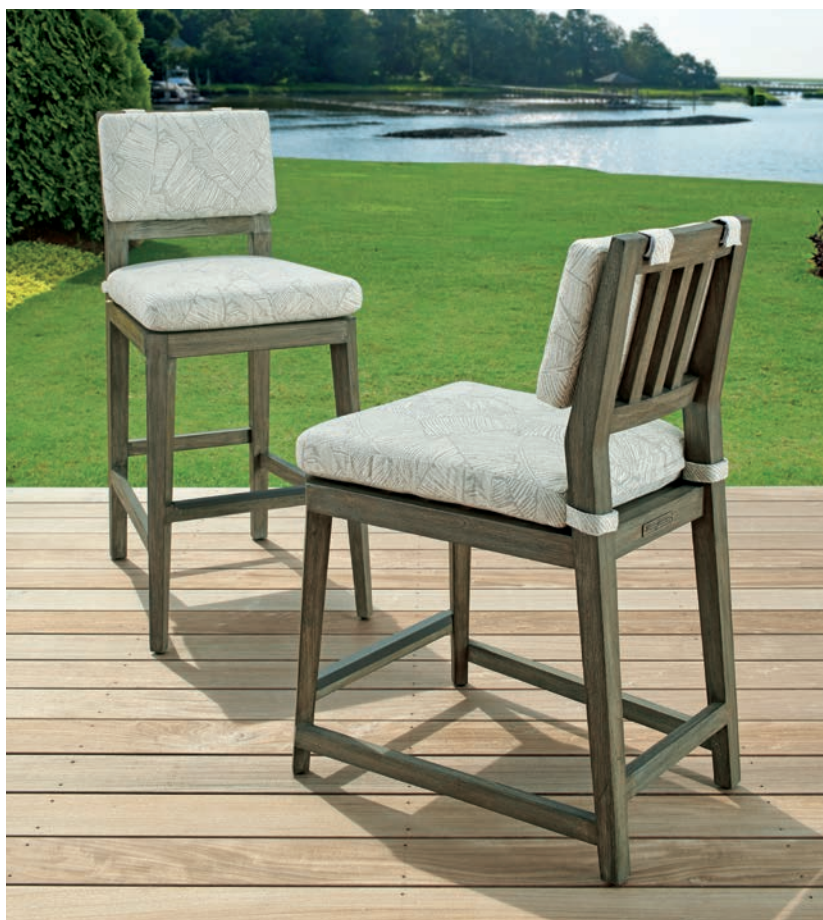
3950-16 / CS3950-16 La Jolla Bar Stool and Cushion Set 20W x 26D x 45.5H in.

The 64-inch bistro table can be used at counter height or at bar height with leg extensions that are included with the piece. The image on the opposite page features the item at bar height. Pass-throughs on the backs of the bar and counter stools accommodate a Velcro strap for the back cushion. This strap will be tailored in the same fabric as the cushion.